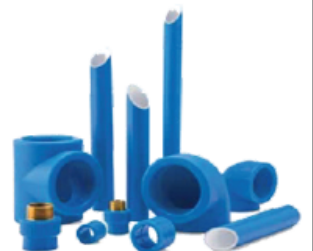
PP-CH (Blue) Thermal FR