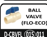
BALL VALVE (FLO-ECO)