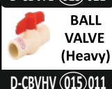
BALL VALVE (Heavy)