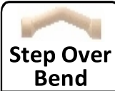
Step Over Bend