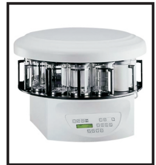
Automatic Tissue Processor