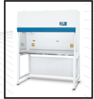
Laminar Air Flow