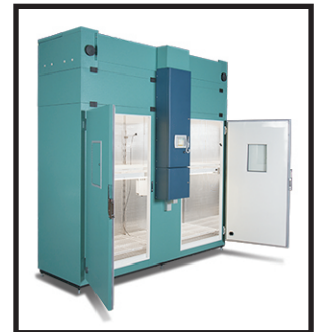
Plant Growth Chamber