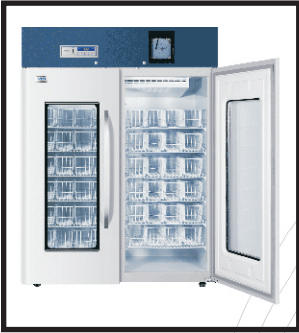
Blood Bank Refrigerator

Mfrs & Exporters of : Scientific Laboratory, Pharmacy & Industrial Automation Products