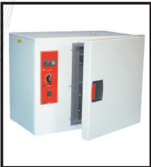
General Purpose Oven