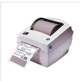
MRP Barcode Label Machine