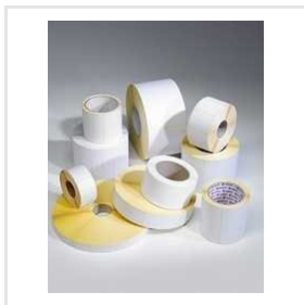
Self Adhesive Labels