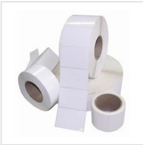
Plain Barcode Labels