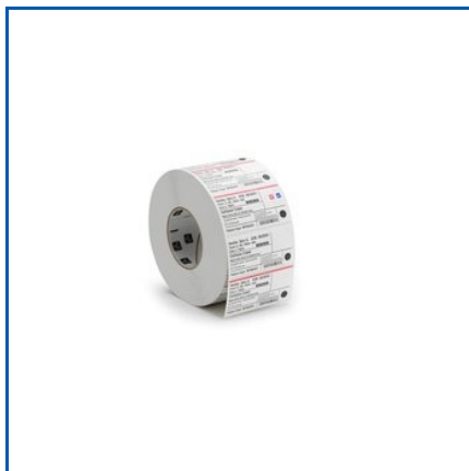
BARCODE PAPER STICKERS