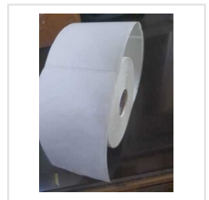
BARCODE Chromo Labels