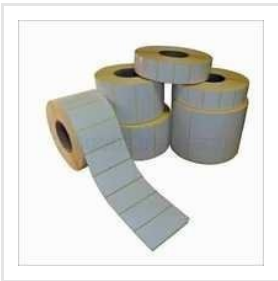
Plain Barcode Labels