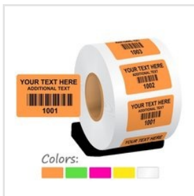
Customized Barcode Stickers