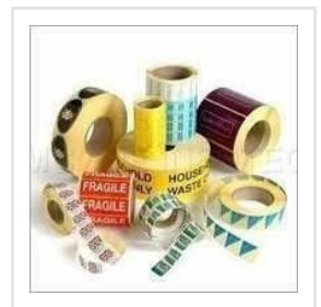
Multi Colour Labels