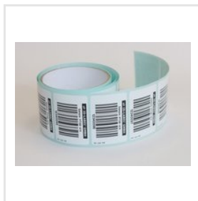
Customized Barcode Labels