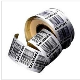
Self Adhesive Barcode Labels