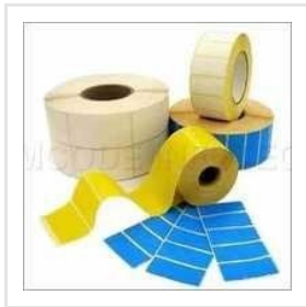
Plain Blank Labels