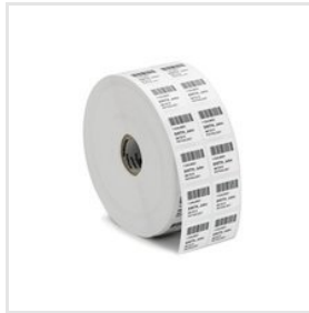
Thermal Barcode Labels