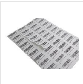
Self Adhesive Barcode Stickers