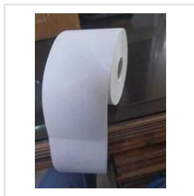
4x6 DT Label (SHIPPING LABEL ROLLS)