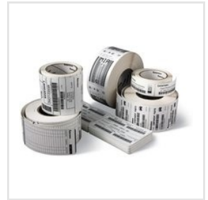
Thermal Barcode Sticker