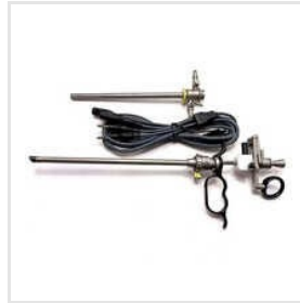
Monopolar Turp Resectoscope Set