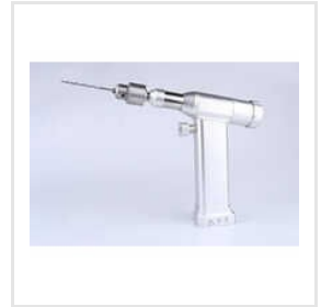
Orthopadic Hand Drills And Accessries