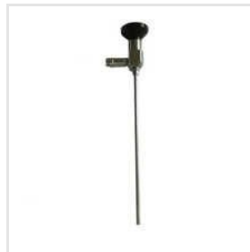
4mm 30 Degree Cystoscope