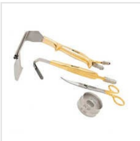
Plastic Surgery Instruments Set