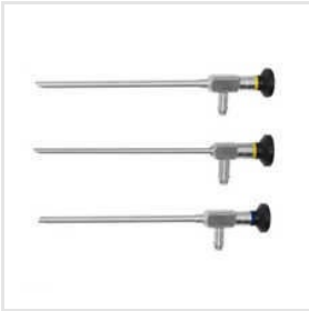
Otology General Instruments