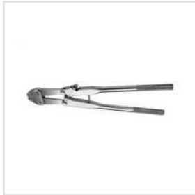
Orthopadic K - Wire Nose Pleirs Cutters And