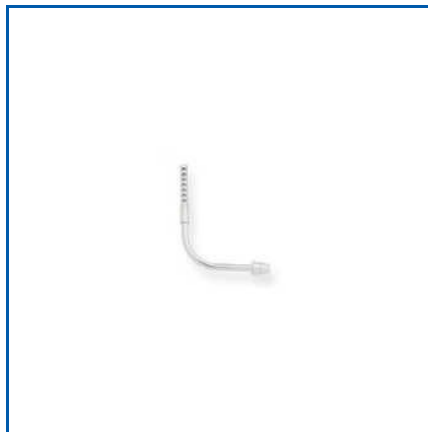
GENERAL DISSECTING FORCEPS