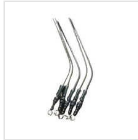
E. N. T Suction Tips