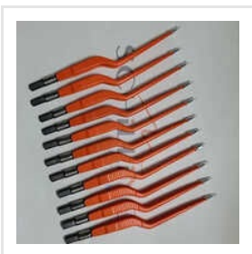
Bayonet Bipolar Forceps