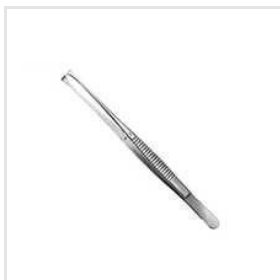
Russian Forceps Stainless Steel