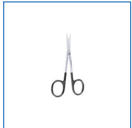
SCHILLING TENATOMY SCISSOR