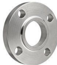
Lap Joint Flanges