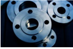
Slip On Flanges