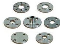
PN 10 GERMAN STANDARD FLANGES