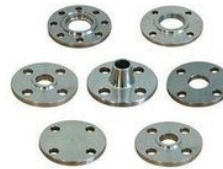
ANSI MS Flanges