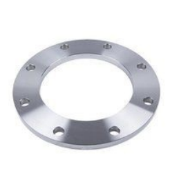
Table H BS 10 British Standard Flanges