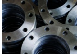
Table E BS 10 British Standard Flanges