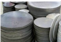
MS Profile Cutting