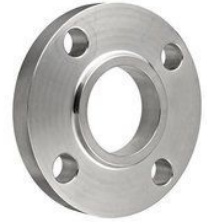
PN 16 German Standard Flanges