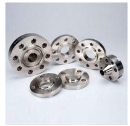
Flanges As Per Indian Standards