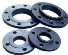
CLASS 150 FLANGES ANSI B 16.5