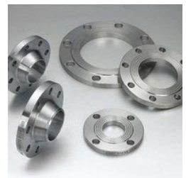
Class 300 Flanges ANSI B 16.5