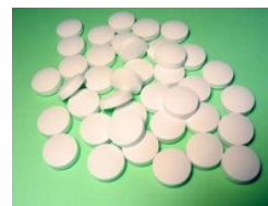
Ras Rasayan Vati