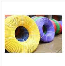
Color HDPE Coil Pipe