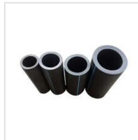
PE 80 Black HDPE Underground Pipe