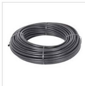
Hdpe Pipe Fittings Pipe