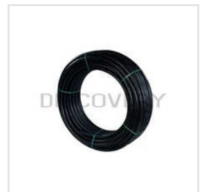
Hdpe Hose Pipe