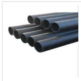
HDPE Agriculture Pipe