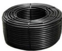
HDPE PIPES AND COIL