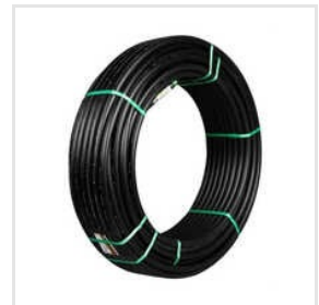
160mm HDPE Coil Pipe