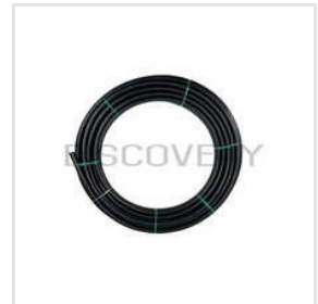
PE80 Hdpe Pipe