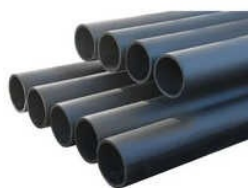
DISCOVERY HDPE AGRICULTURE PIPE

01_160mm Pprc Water Line Pipe, 01_JJM Approved PPR 3 Layer Pipes, 02_JJM Approved PPR 3 Layer Pipes, 03_Ppr Pipe, 04_Ppr Pipe, 05_Discovery Pprc Pipe, 06_Discovery Pprc Pipe, 07_20mm 3 Layer PPR Pipe, 08_20mm 3 Layer PPR Pipe, 09_20mm 3 Layer PPR Pipe, 1 Inch PPH Pipes, 150 mm HDPE Coil Pipe, 160mm HDPE Coil Pipe, 2 Inch PPH Pipes, 20mm MDPE Pipe, etc.