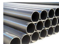
DRINKING WATER HDPE PIPE