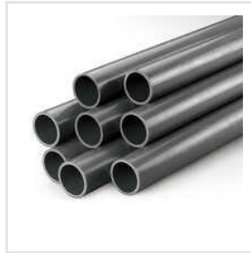
HDPE Sprinkler Pipe