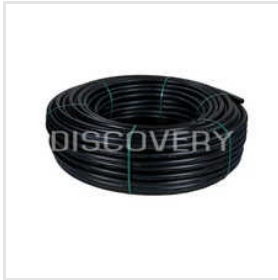
HDPE Agriculture Coil Pipe