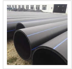
Underground HDPE Pipe