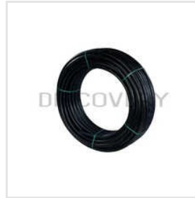
PE100 HDPE Pipe