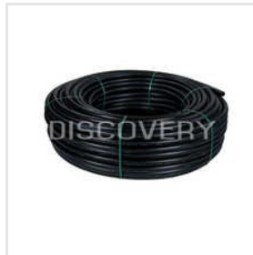
Krushi Kranti HDPE Pipe