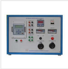
240 V Testing Panel