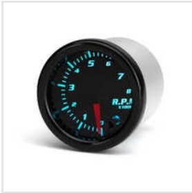
127 Mm RPM Meter