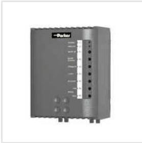
Parker 210 V DC Drives