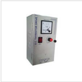
Thyristor 230 V DC