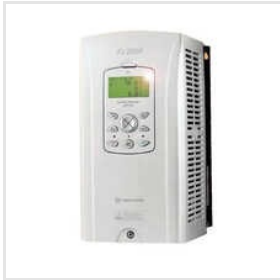
480V AC Drive