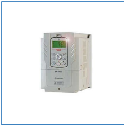
INDUSTRIAL 480 V AC DRIVE