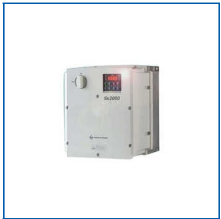
INDUSTRIAL AC DRIVE