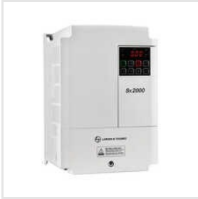
V AC Drive