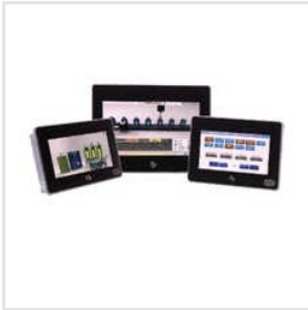
Series Human Machine