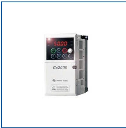
INDUSTRIAL 230 V AC DRIVE

127 mm RPM Meter, 128Kb Communication Modules, 240 V Digital Voltmeter, 240 V Testing Panel Board, 415 V Control Panel Board, 480 V AC Drives, 480V AC Drive, AC And DC Drive Repairing Service, DB Panel Board, Fully Automatic Human Machine Interface, Industrial 230 V AC Drive, Industrial 480 V AC Drive, Industrial AC Drive, Industrial Programmable Logic Controller, L And T 480 V Delta VFD, etc.