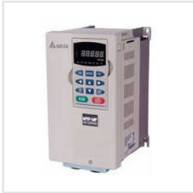
L And T 480 V Delta VFD