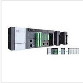
U Programmable Logic