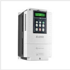
480 V AC Drives