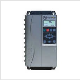
V Soft Starter