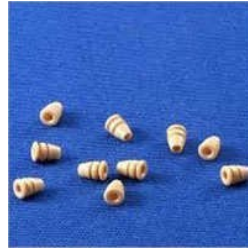
Industrial Peek Products