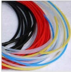
Industrial PTFE Tube