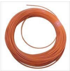
PTFE Pigmented Tubing