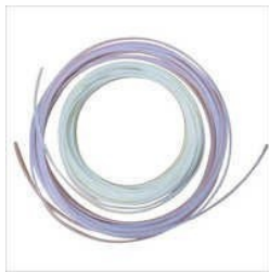
PTFE Striped Tubing