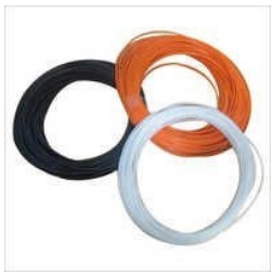
PTFE Natural Tubing