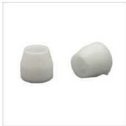
Industrial PTFE Ferrule