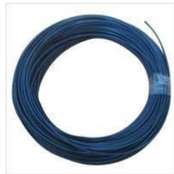
PTFE Markable Tubing