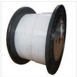
PTFE Extruded Tubing