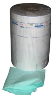
Flat Sterilization Roll