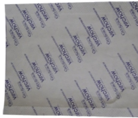
Paper Laminated Pouches