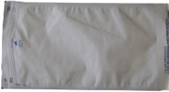
Self Seal Pouches