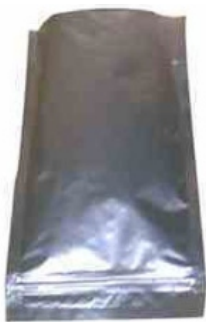
Aluminium Foil Pouches