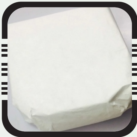
Tyvek Sterlization Wraps