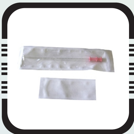
Self Seal Sterilization Pouch