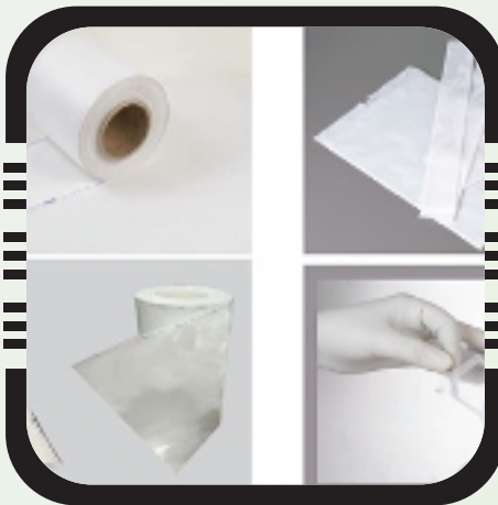
Tyvek and Pouches