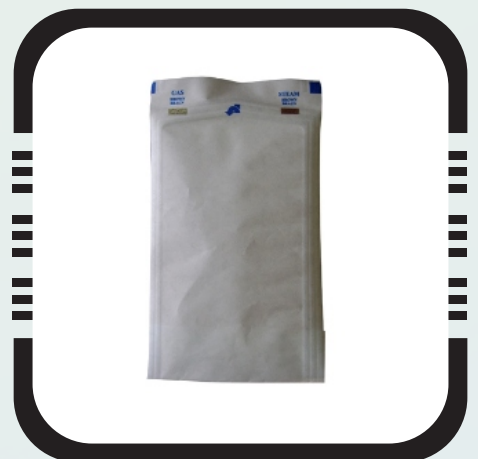
Center Seal Pouches