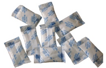
Silica Gel Pouches