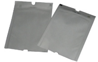
Plain Paper Pouch