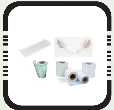
Hospital Reels and Pouches