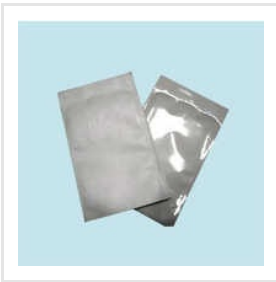
Film Pouches For Medical