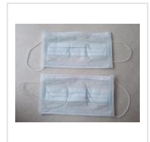
3 Ply Surgical Mask