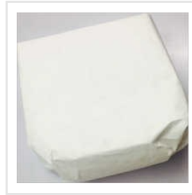
Tyvek Sterilization Wraps