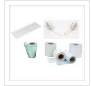
Hospital Reels And Pouches