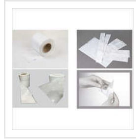
Tyvek And Pouches