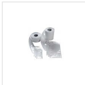
Tyvek Pouch For Medical