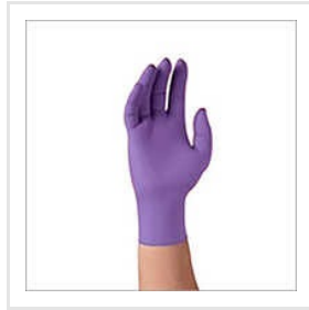
Disposable Gloves Pouches