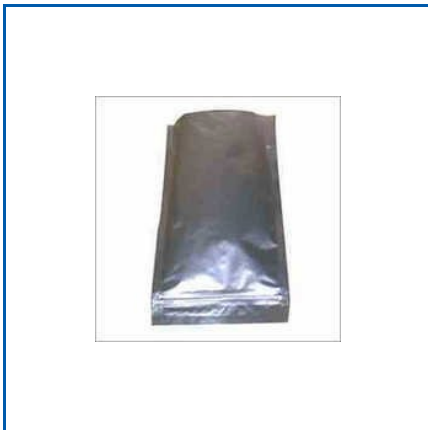
ALUMINIUM FOIL POUCHES

3 Ply Face Mask, 3 Ply Surgical mask, Adhesive Tapes, Aluminium Foil Pouches, Blood Bags, Blood Transfusion Bags for Hospitals, Center Seal Pouches, Digital Thermometer, Disposable Gloves Pouches, Face Shield for Protection against Covid19, Film Pouches For Medical, Flat Sterilization Roll, Gusseted Pouch, Gusseted Rolls, Header Bags, etc.