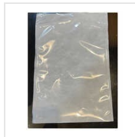
Tyvek Sterilization Pouch