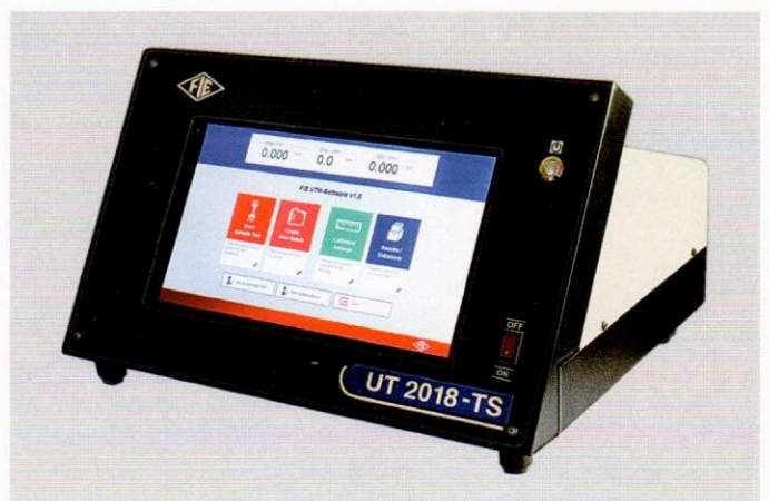
Touch Screen Control Panel UT 2018-TS

FIE Horizontal Chain and Rope Tensile Testing Machine comply with Grade "A" of BS:1610-1964 and Grade 1.0 of IS:1828-1975. An accuracy of \pm 1\% is guaranteed from 20% of the load range selected to full load.