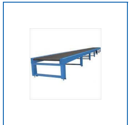
OMNI METALCRAFT POWER BELT CONVEYORS