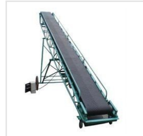
Inclined Belt Conveyor