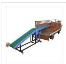
Truck Loader Conveyor