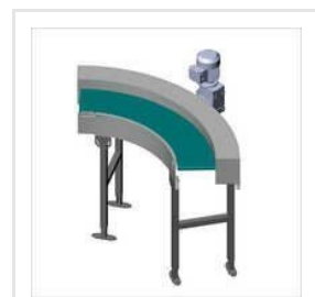
90 Degree Belt Conveyor