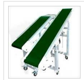
Pvc Belt Conveyor