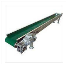
Cleated Belt Conveyor