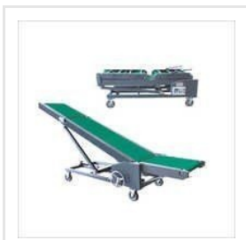
Flexible Motorized Belt Conveyor