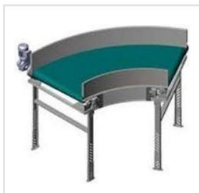
90 Degree Belt Conveyor