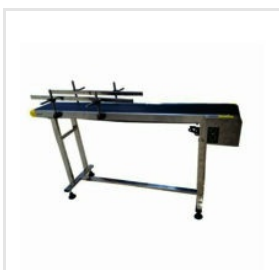
Inkjet Printing Conveyor