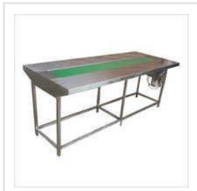
Pvc Packing Conveyor Belt