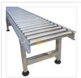
Gravity Roller Conveyor