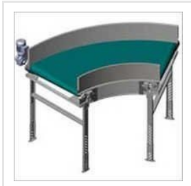
90 Degree Belt Curved Conveyor