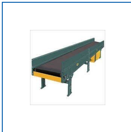
MATERIAL HANDLING BELT CONVEYOR