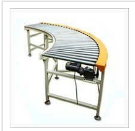
Roller Conveyor 90 Degree