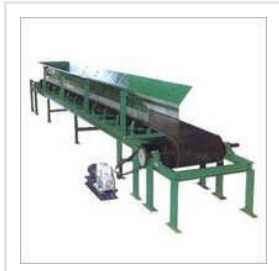
Rubber Belt Conveyor