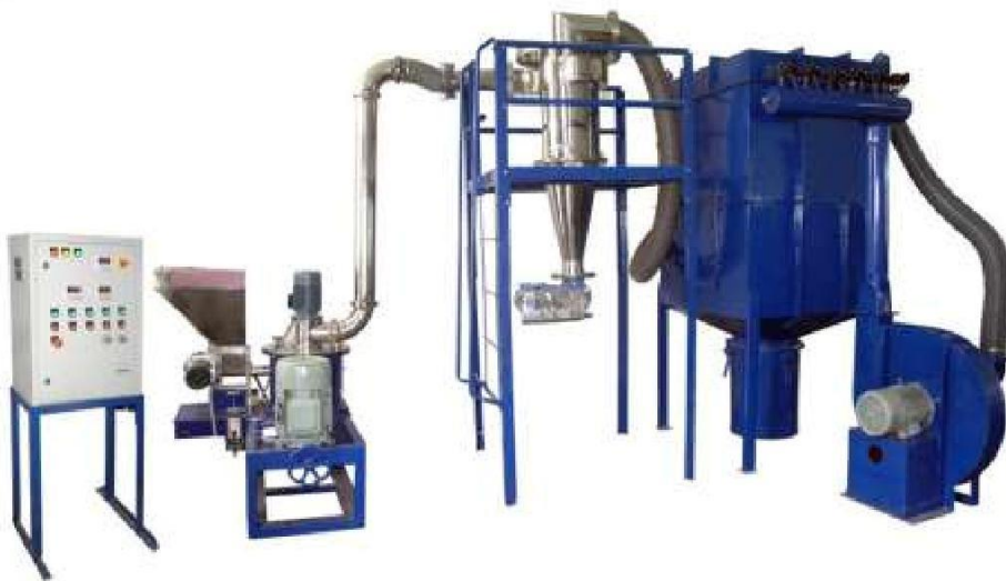
ACM GRINDING MILL MPT-20