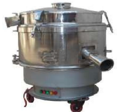
ULTRASONIC SIEVING MACHINE