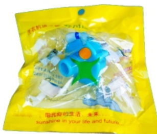
Washing Machine Auto Inlet Adopter