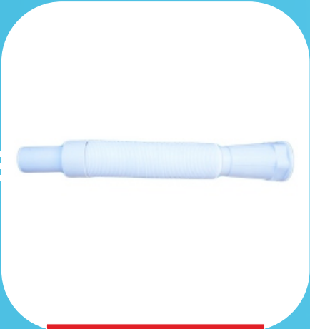
Super Deluxe Flexible Waste Pipe