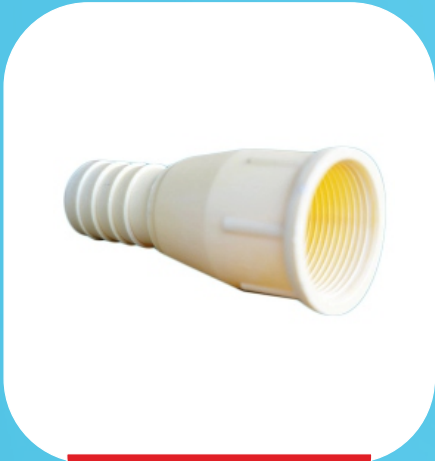
Waste Pipe Coupler