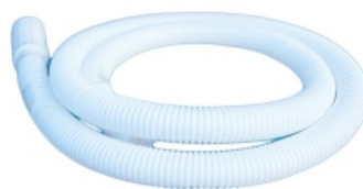
Washing Machine Semi Inlet Pipe