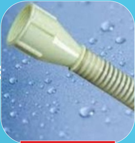
Super Flow Waste Pipe