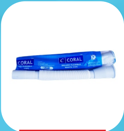
Deluxe Flexible Waste Pipe