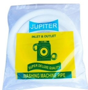
Washing Machine Outlet Pipe