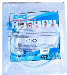
Washing Machine Auto Inlet Pipe