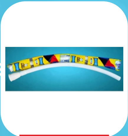
Braided Waste Pipe