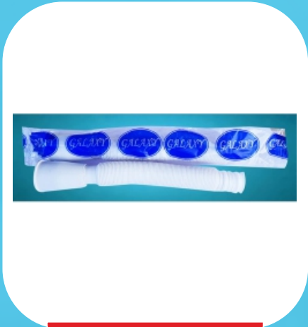
Light Flexible Waste Pipe