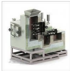
ALUMINIUM MELTING FURNACE