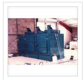
Powder Coating Ovens