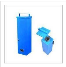
Welding Electrodes And Flux Drying Oven