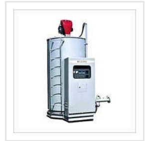
Oil Fired Industrial Furnace