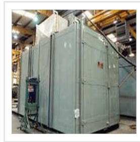
Gas Industrial Furnace