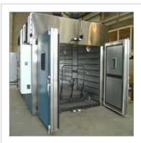
Heating Oven For Shrink Fitting