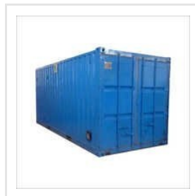
Wood Curing Oven