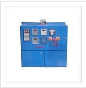
Wood Curing Oven (Control Panel)