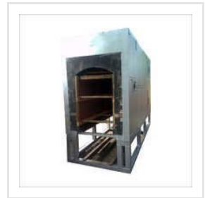
Gas Oil Incinerator