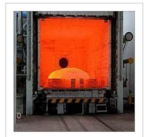
Heat Treatment Plants