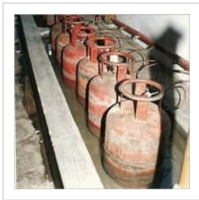
Gas Cylinders Manifold