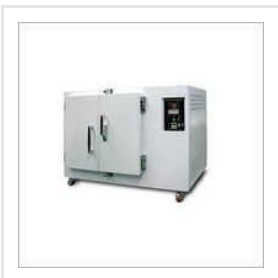
Electrically Heated Industrial Oven