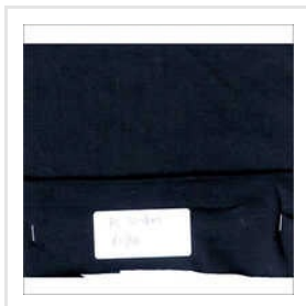
44 Inch 155-160 GSM Sinker Fabrics