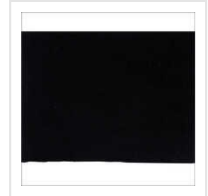
42 Inch 250 GSM PC Loop Knit Fabrics