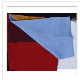
44 Inch Sinker Fabrics