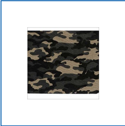
190-195 GSM AIRJET JUNGLE PRINT POLYESTER FABRICS