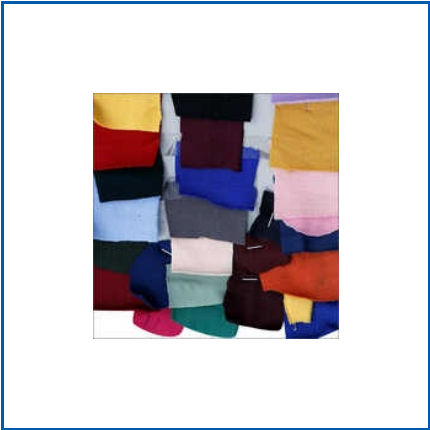
38 INCH 220-280 GSM 100% POLYESTER FLEECE FABRIC