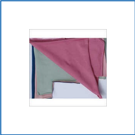
75 INCH COTTON LYCRA FABRICS

190-195 GSM Airjet Jungle Print Polyester Fabrics, 24 Gauge Sinker Machine, 28 Gauge Sinker Machine, 38 Inch 220-280 GSM 100% Polyester Fleece Fabric, 42 Inch 250 GSM PC Loop Knit Fabrics, 42 Inch Spun Sinker 180-185 GSM 100% Polyester Fabrics, 44 Inch 155-160 GSM Sinker Fabrics, etc.