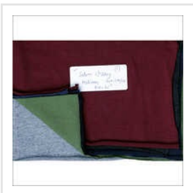
45 Inch 170-175 GSM Polyster Cotton Fabrics