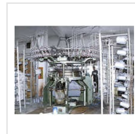
28 Gauge Sinker Machine