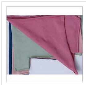
75 Inch Cotton Lycra Fabrics