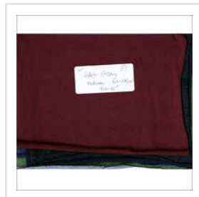
45 Inch Galaxy 170-175 GSM Recycled Fabrics