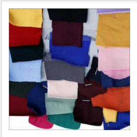
38 Inch 220-280 GSM 100% Polyester Fleece