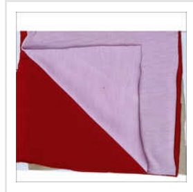
42 Inch Spun Sinker 180-185 GSM 100%