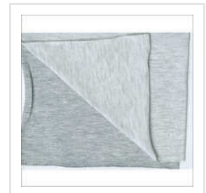
44 Inch 150-155 GSM Sinker Fabrics