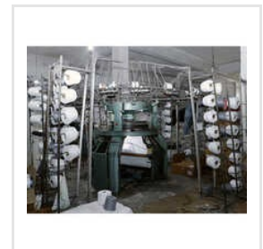
24 Gauge Sinker Machine