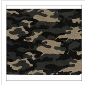
190-195 GSM Airjet Jungle Print Polyester