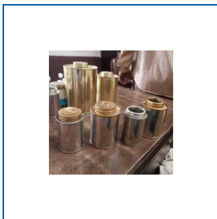
METAL TIN BOX