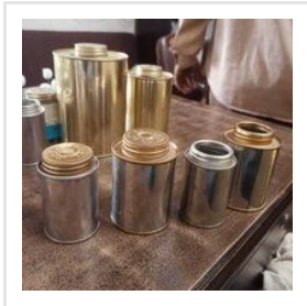
Round Shape Metal Tin Container