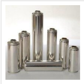
Aerosol Tin Can