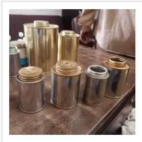
Metal Tin Container