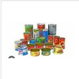
METAL TIN BOXES