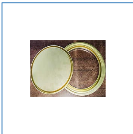
GOLD LACQUER PAINT TIN COMPONENT