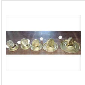
Brush In Can Components