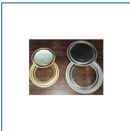
PAINT TIN COMPONENT

Aerosol Tin Can, Aerosol Tin Container, Brush In Can Components, Food Metal Tin Container, General Industrial Paint Tin Components, Gold Lacquer Paint Tin Component, METAL TIN BOXS, Metal TIN Box, Metal Tin Container, Paint Tin Component, Round Shape Metal Tin Container, Round type Metal Tin, Tin Can Component, Tin Paint Component, etc.