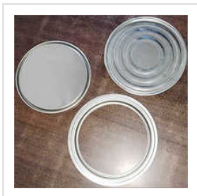
General Industrial Paint Tin Components