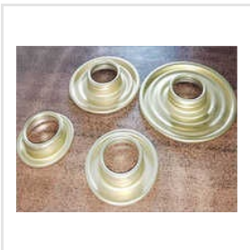
Tin Paint Component