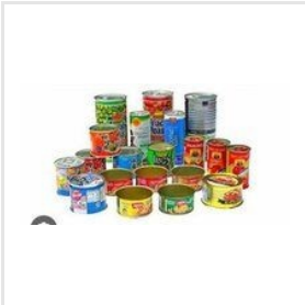
Food Metal Tin Container