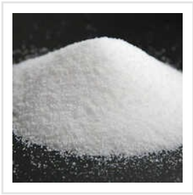
LR Grade Potassium Chloride