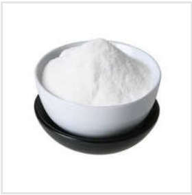
Vitamin C Ascorbic Acid