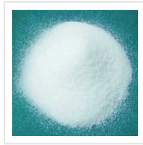
Sodium Sulphite Powder