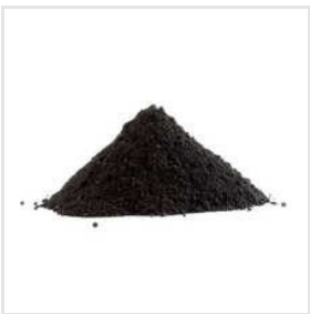
Anhydrous Ferric Chloride Powder