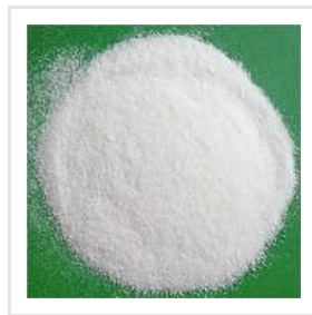
Zinc Sulphate Heptahydrate Powder