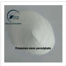
Potassium Mono Persulfate