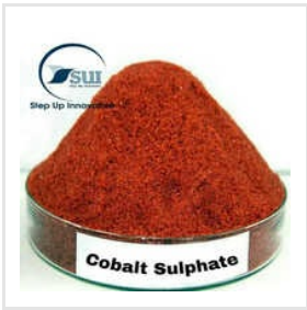
Cobalt Sulphate Heptahydrate Powder