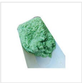
Ferrous Sulphate Heptahydrate