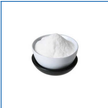
VITAMIN C PLAIN ASCORBIC ACID POWDER

10.5% Boron Powder, Acrylic Acid, Ammonium Chloride, Ammonium Sulphate, Anhydrous Sodium Sulphate, Ascorbic Acid, Calcium Chloride, Calcium Nitrate, Cobalt Sulphate, Copper Sulphate, Dicalcium Phosphate, Dry Magnesium Sulphate, Ferrous Sulphate, Magnesium Chloride Flakes, Magnesium Chloride Powder, etc.