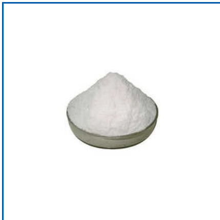
ZINC SULPHATE MONOHYDRATE