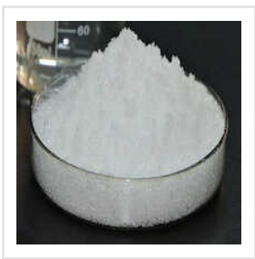
Magnesium Sulphate Heptahydrate