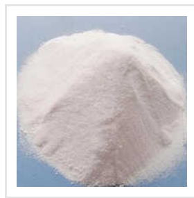
Manganese Sulphate Monohydrate