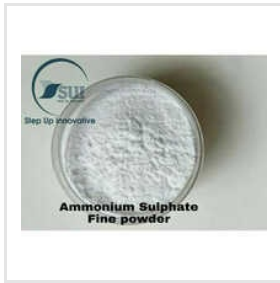
White Ammonium Sulphate Powder