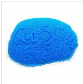
Copper Sulphate Powder