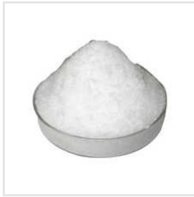
Pharma Grade Potassium Chloride