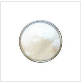
Fertilizer Grade Ammonium Sulphate