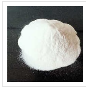
Mineral Mixture Powder