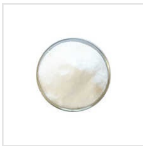
White Ammonium Chloride Powder