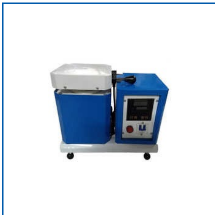
SILVER MELTING FURNACE

10 KLD Industrial ETP Plant, 1000kg Aluminum Melting Furnace, 100kg Industrial Rotary Dryer, 1300W Electric Oven, 150kw Induction Hardening Machines, 1600 C Programmable Muffle Furnace, 1600C Sintering Machine, 240V High Temperature Muffle Furnace, 2700W Electric Oven, 40kw Induction Hardening Machine, 5000 CFM Industrial Wet Scrubber, 7kw Laboratory Furnaces, 80 20 Nichrome Wire, 80-20 Nichrome Wire, Aluminium Degassing Machine, etc.