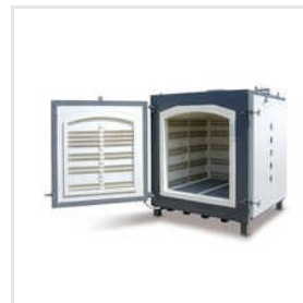
Industrial Heating Furnaces