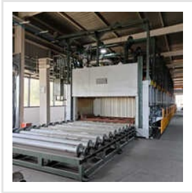
Industrial Electric Furnaces