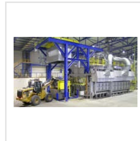
Aluminum Smelting Furnaces