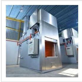
Gas Fired Crematorium