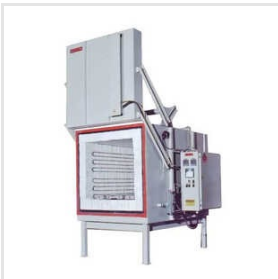
Electric Industrial Furnaces