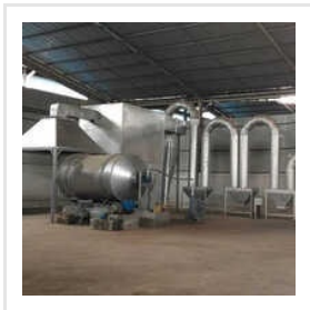
Lead Recycling Plant