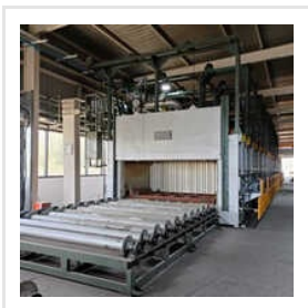
Industrial Electric Furnaces