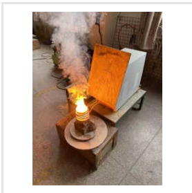
Induction Melting Furnaces