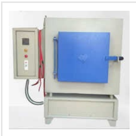
7kw Laboratory Furnaces