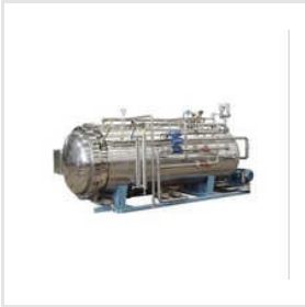
Horizontal Sealed Retort Furnace