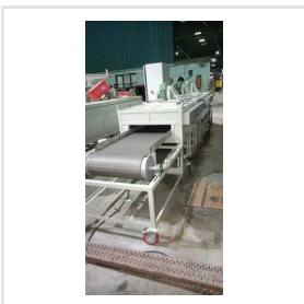
Mesh Belt Furnace