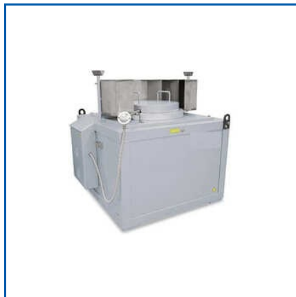
SALT BATH FURNACE