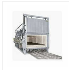
Bogie Hearth Furnaces