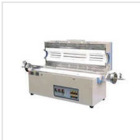
Split Tube Furnaces