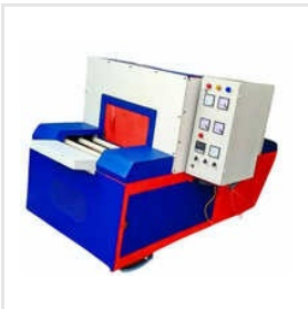
Roller Tube Furnace