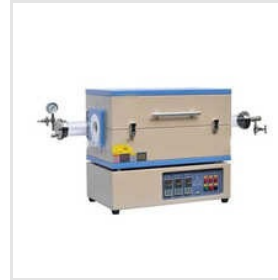
Vacuum Sintering Furnace