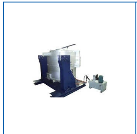
1000KG ALUMINUM MELTING FURNACE