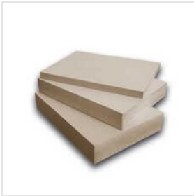
15mm WPC Board