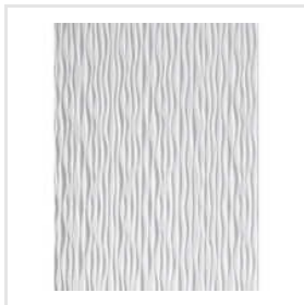
PVC Wave Board