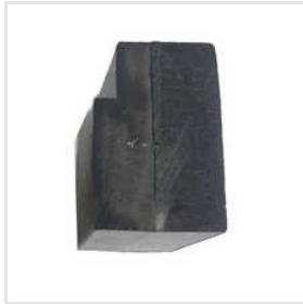
WPC Solid Door Frames