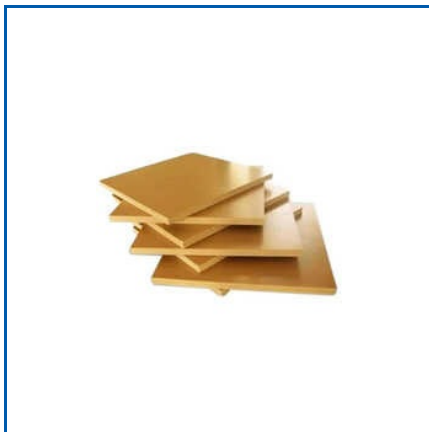
18MM WPC BOARD

11mm WPC Board, 15mm WPC Board, 17mm WPC Board, 18mm WPC Board, 20mm WPC Board, 22mm Plus Size WPC Door Board, 25mm WPC Board, 28mm WPC Door Board, 4 mm Industrial Stone Polymer Composite Flooring, 4 mm PVC Flooring Plank, 4mm Stone Polymer Composite Flooring, 50 m PVC Edge Banding Tape, 60 x 30mm PVC Door Frames, 6mm WPC Board, 8 x 4 FT Marble UV Sheet, etc.