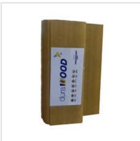
PVC Door Frames