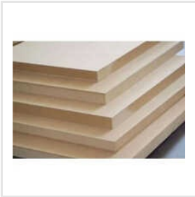
11mm WPC Board