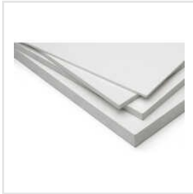
25mm WPC Board