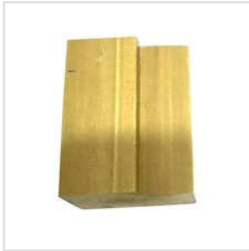
Single Pattern Door Frames