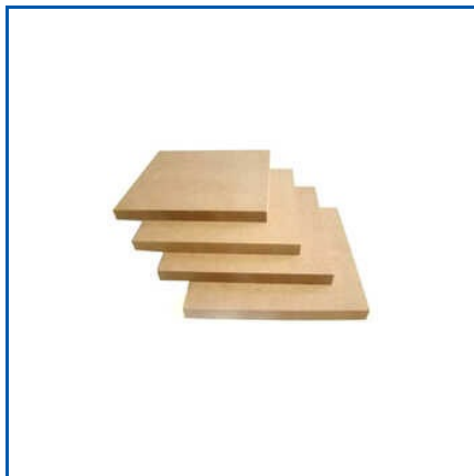
17MM WPC BOARD