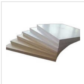
White PVC Celuka Board