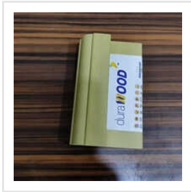
28mm WPC Door Board