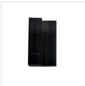
60 X 30mm PVC Door Frames