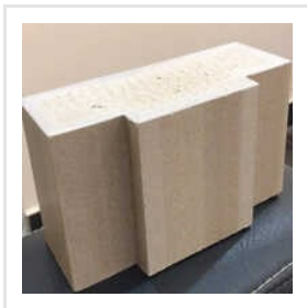
Wooden Door Frames