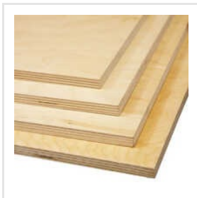
6mm WPC Board