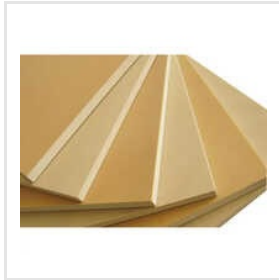
8mm WPC Board