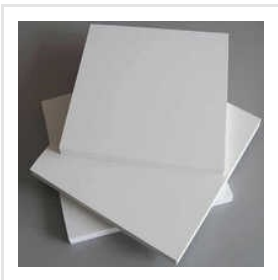
PVC Foam Board