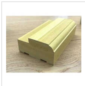
Rectangular WPC Window Frames