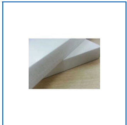
20MM WPC BOARD