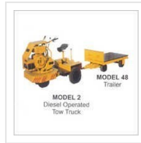
Diesel Operated Tow Truck With Trailer