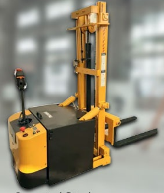
Battery Operated Stacker

Skillful execution and intelligent direction, are the two reasons of our success.