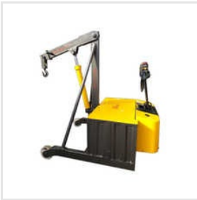
Battery Operated Floor Crane