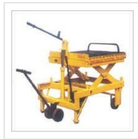
Die Loader With Tilting Platform