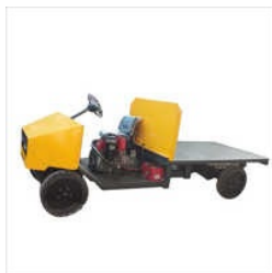
DIESEL PLATFORM TRUCK

14 Seater Golf Cart, 2 Seater Golf Cart, 4 Seater Golf Cart, 6 Seater Golf Cart, 6 Seater Golf Cart (4+2) option, Battery Operated Floor Crane, Battery Operated Loader, Battery Operated Pallet Truck, Battery Operated Platform Truck, Battery Operated Scissor Table, Battery Operated Stacker, Cage Type Industrial Lift, Cage Type Lift, Compact Golf Cart, Counter Balance Floor Crane, etc.