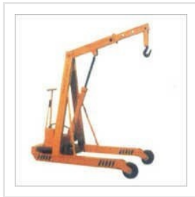
Hydraulic Floor Crane