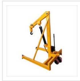
Manual Floor Crane