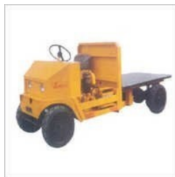
DIESEL OPERATED PLATFORM TRUCK