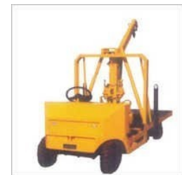
DIESEL OPERATED PLATFORM TRUCK WITH CRANE