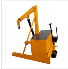
Counter Balance Floor Crane