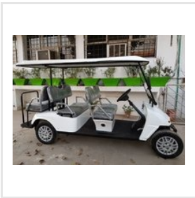
6 Seater Golf Cart (4+2) Option