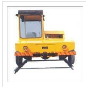
Diesel Operated Rail Tow Truck