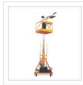
High Rise Working Platform