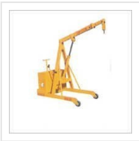
Mobile Floor Crane