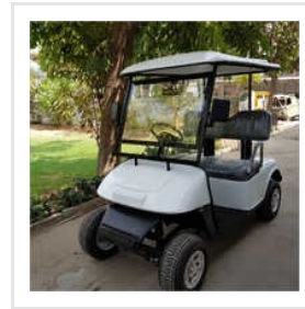
2 Seater Golf Cart