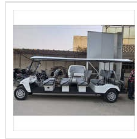
14 Seater Golf Cart