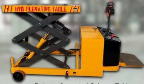
Battery Operated Scissor Table