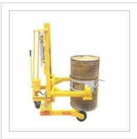
Hydraulic Drum Lifter