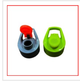
46 MM Flip Top Fridge Bottle Cap