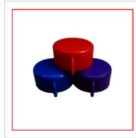
46 MM Matte And Glossy Hook Cap