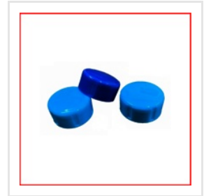
46 MM Flower Fridge Bottle Cap