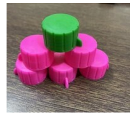
28 MM FRIDGE BOTTLE CAP