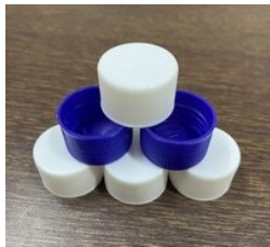
28 MM ROPP PLASTIC CAP

120 mm Jar Handle Cap, 120 mm Jar Handle Cap, 120 mm Design Cap, 120 mm Honey Cap, 120 mm Jar Handle Cap 29grams, 120 mm Lollipop Jar Cap, 120 mm Plastic Jar Cap 15 grams, 120 mm Plastic Jar Cap 17 grams, 120 mm Plastic Jar Cap 21grms, 120 mm Plastic Lollipop Jar Cap, 120 mm Sunpet Cap, 19 MM Flip Top Cap, 19 MM Hat Cap, 19 MM Nipple Cap, 2 LTR Plastic Water Jug, etc.