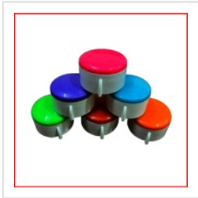
46 MM Double Color Fridge Bottle Cap