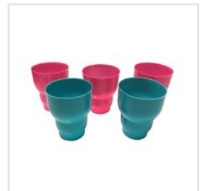
38 MM Plastic Glass Cap