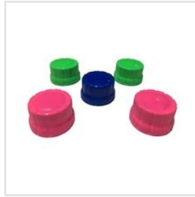
46 Mm Plain Fridge Bottle Cap