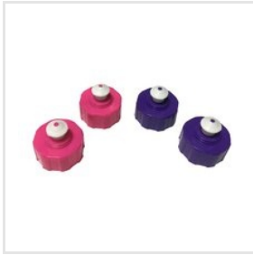
46 MM Pull Push Cap