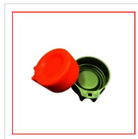
46 MM Milton Fridge Bottle Cap