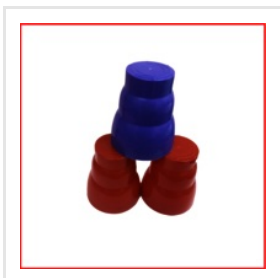
46 MM Plastic Glass Cap