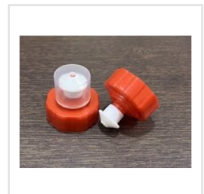
38 MM Pull Push Cap