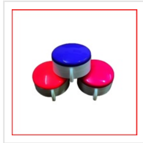
38 MM Double Color Fridge Bottle Caps