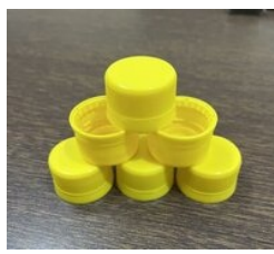
28 MM PCO NECK CAP