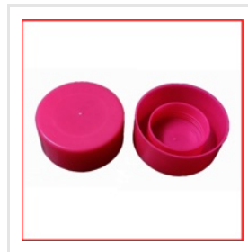
46 MM Big Fridge Bottle Cap