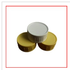
46 MM Pesticide Cap