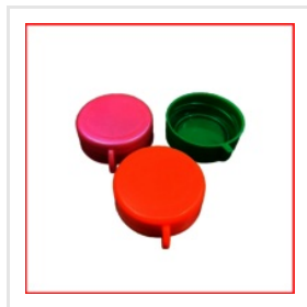
38 MM Fridge Bottle Hook Cap