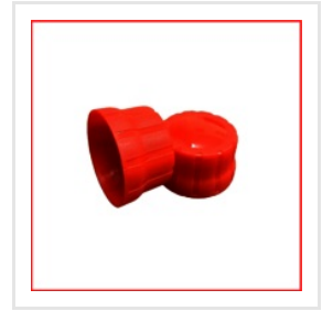
46 MM Fridge Bottle Cap