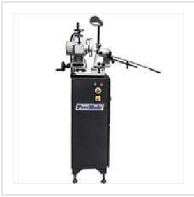
Gundrill Regrinding Machine