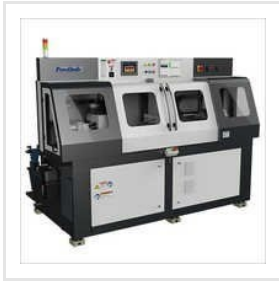
Micro Gun Drilling Machines