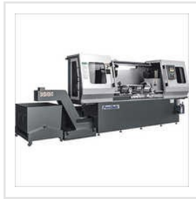
Facing & Centering Machines