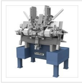
Specially Designed Machine