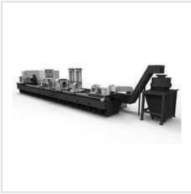
BTA Deep Hole Drilling Machine