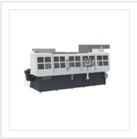
Gun Drilling Machine