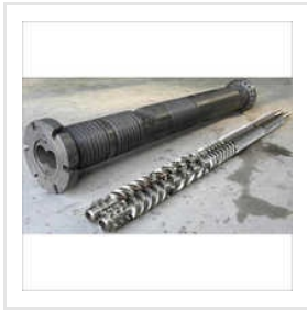
Twin Screw Barrel