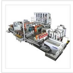
Deep Hole Drilling SPM's