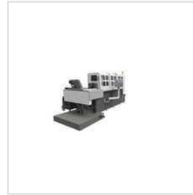
Three Axis Gun Drilling Machine