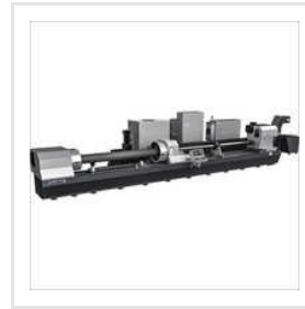
BVN40 BTA Drilling Machines