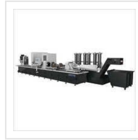
Skiving And Roller Burnishing Machines