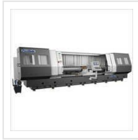
Twin Spindle Automatic BTA Drilling