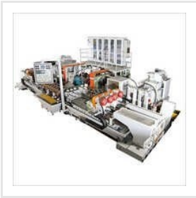
Customized Deep Hole Drilling Machine