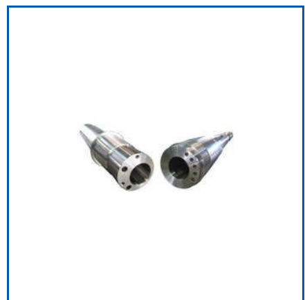
PRECISION DRILLING COMPONENTS