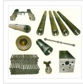
Deep Hole Drilling Services