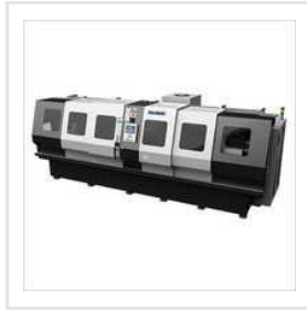
Single Axis Gun Drilling Machine