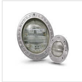
Intellibrite 5G Underwater Color