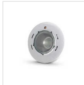
Hilite Pool Lighting