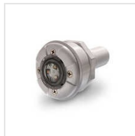
Globrite Color Changing LED Lights