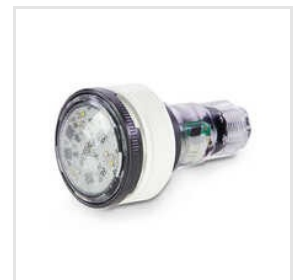
Microbrite Color And White LED Light