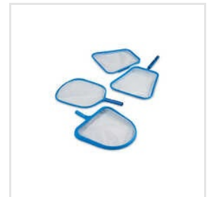
Hand Skimmers And Leaf Rakes