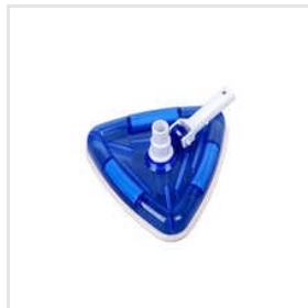
Liner Pools Vacuum Heads