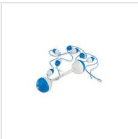
Floats And Safety Equipment