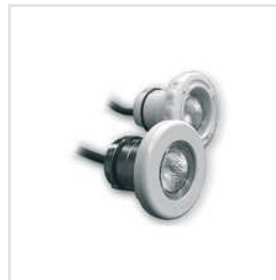
Mini Dichroic Light