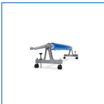
POOL COVER ROLLER

30m Air Tube Coil, Air Blowers, Air Lounger, Air Pad Bubble Seat, Aluminium Vacuum Head, Automatic Safety Slatted Cover, Bottom Outlet Air Switch, CDE-FCO Dosing Pump, CDE-KCL Dosing Pump, CDE-VCL Dosing Pump, CDE-WDPHCL Dosing Pump, CKSA018 Water Curtain, Cartridge Filters, Centrifugal Water Filtration, Chlorine Feeder, etc.