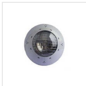
Flat UW Light