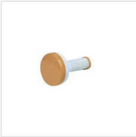
Floating Chemical Dispensers