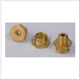
Brass CNG Gas Kit Parts