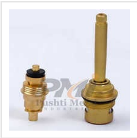
Brass Sanitary Components