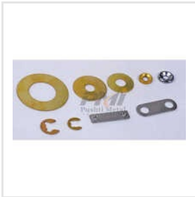
Brass Sheet Metal Components