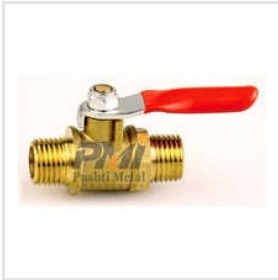
Industrial Brass Ball Valve