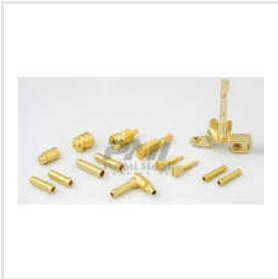
Brass Turned Components