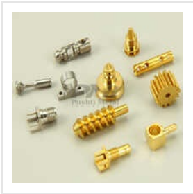
CNC Turned Components