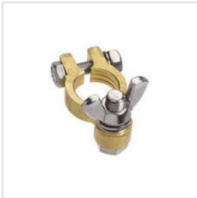
Brass Battery Terminal