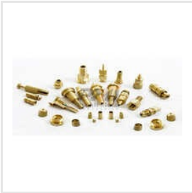
Industrial Brass Precision Components