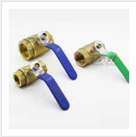
Brass Ball Valves