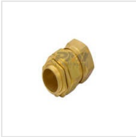
Brass Cable Gland