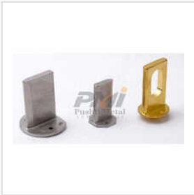
Brass Electrical Components