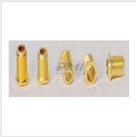
Industrial Brass Electronic Components