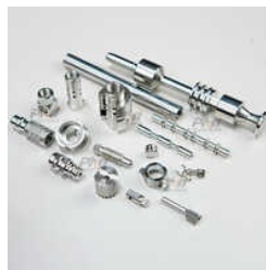
ELECTRIC ALUMINUM COMPONENTS