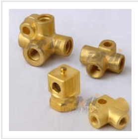
Brass CNG Auto Parts