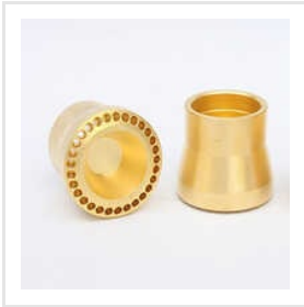
Brass AC Parts