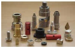
INDUSTRIAL ALUMINUM COMPONENTS

Brass AC Parts, Brass Adaptor And Reducer, Brass Ball Valves, Brass Barb Fittings, Brass Battery Terminal, Brass CNG Auto Parts, Brass CNG Gas Kit Parts, Brass Cable Gland, Brass Earting Accessories, Brass Electrical And Electronic Components, Brass Electrical Components, Brass Electrical Plug Pins, Brass Forged Components, Brass Male Female Insert, Brass Molding Insert, etc.