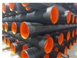
HDPE DWC Pipe