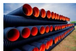
DWC HDPE Pipe