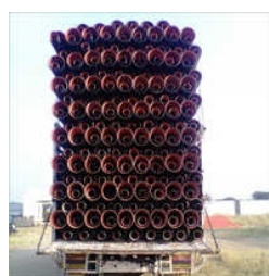
Telescoping DWC Pipes