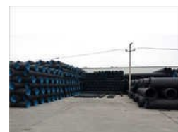
DWC PIPE 150 MM TO 500 MM