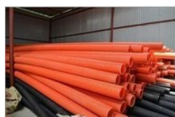
DWC Pipe For Electrical Installation