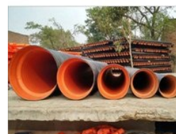
Double Wall Corrugated Pipe