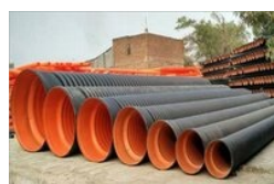
Double Wall Corrugated Pipe