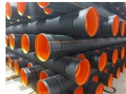
HDPE DWC Pipes