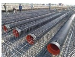
DWC Pipe For Sewerage