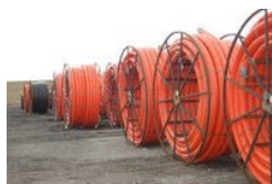
DWC HDPE PIPE