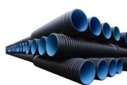
HDPE Double Wall Corrugated Pipe