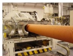
DWC HDPE Corrugated Pipe 150 MM TO 500 MM