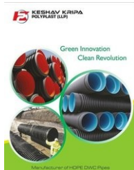
DWC HDPE Pipes