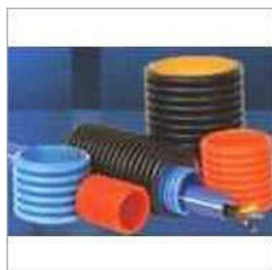
HDPE WALL CORRUGATED PIPE

Agriculture HDPE Pipes, Base Density Testing Instrument, Cable Duct DWC Pipe, Cable Ducting, DWC Cable Duct Pipes 40 MM, DWC HDPE Corrugated Pipe 150 MM TO 500 MM, DWC HDPE PIPE, DWC HDPE Pipe, DWC HDPE Pipes, DWC PIPE, DWC Pipe For Electrical Installation, DWC Pipe For Sewerage, DWC Pipe For Telecom, DWC Sewerage Pipe 100 MM TO 500 MM, Double Wall Corrugated Pipe, etc.