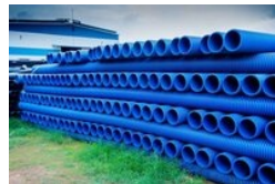
DWC Sewerage Pipe 100 MM TO 500 MM