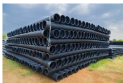
Dwc Pipe 100 Mm To 500 Mm