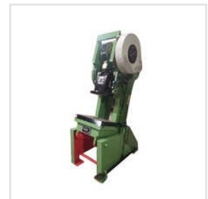
10 Ton Power Press Machine