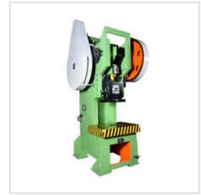
150 Ton C Type Power Press Machine