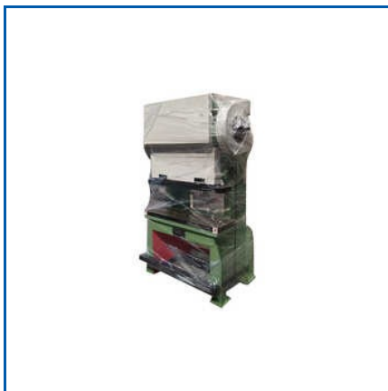
50 TON POWER PRESS MACHINE

10 Ton Power Press Machine, 10 Ton Power Press Machines, 100 Ton C Type Heavy Duty Power Press Machine, 125 Ton Power Press Machine, 150 Ton C Type Power Press Machine, 20 Ton C Type Power Press Machine, 20 Ton Full Body C Type Power Press Machine, 20 Ton Mild Steel Semi Automatic Power Press Machine, 20 Ton Semi-Automatic Double Gear Power Press Machine, 200 Ton Power Press Machine, 240 V MS Steel Body Power Press Machines, 30 Ton C Type Power Press Machine, 30 Ton Mild Steel Power Press Machine, 320 V Mechanical Power Press Machine, 40 Ton Mechanical Power Press Machine, etc.