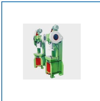
HYDRAULIC POWER PRESS