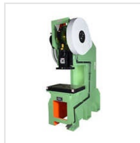
Manual Mechanical Power Press Machine