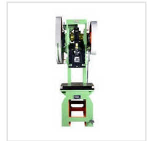
240 V MS Steel Body Power Press Machines