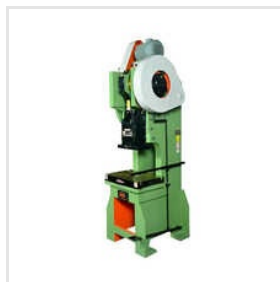
40 Ton Mechanical Power Press Machine