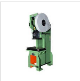
50 Ton Mild Steel Power Press Machine