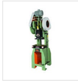
10 Ton Power Press Machines