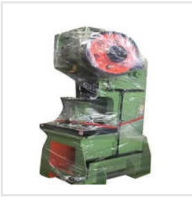
60 Ton C Type Power Press Machine