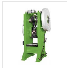
Metal Special Purpose Power Press Machines