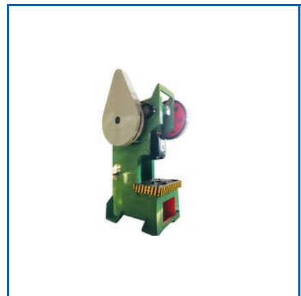
INDUSTRIAL C TYPE POWER PRESS MACHINE