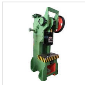
125 Ton Power Press Machine