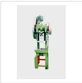
Pneumatic Power Press