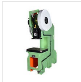
30 Ton C Type Power Press Machine