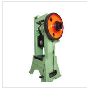
Cast Iron C Type Power Press Machine