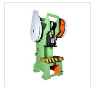
200 Ton Power Press Machine