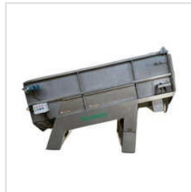
Teknofanghi Screw Press Machine