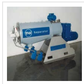
Press Screw Separator Fan