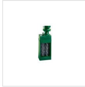
Muffin Monster Inline Sewage Grinder