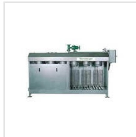
Industrial Sludge Dewatering Machine