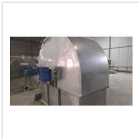
Half Drum Screen