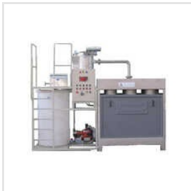
Bag Dewatering Machine