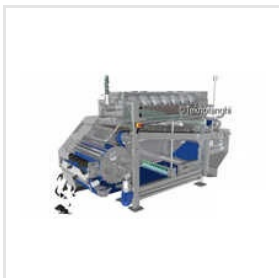
Belt Filter Press Machine