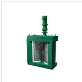
Channel Monster Series Grinder