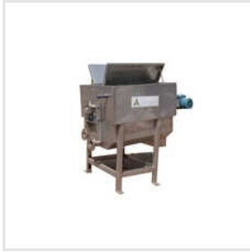
Rotary Drum Screen