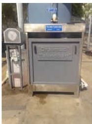
TEKNOBAG DRAIMAD WITH SKID

Arched Rotary Screen, Bag Dewatering Machine, Belt Filter Press Machine, Channel Monster Series Grinder, Dynamic Thickener, Half Drum Screen, Industrial Decanter Separator Machine, Industrial Sludge Dewatering Machine, Industrial Submersible Mixer Fan, Mechanical Brush Screens, Mini Filtering Screw Screen, Muffin Monster Inline Sewage Grinder, Multirake Bar Screen, Polyelectrolyte Preparation Unit, Press Screw Separator Fan, etc.