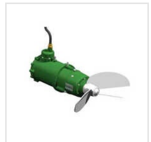
Industrial Submersible Mixer Fan