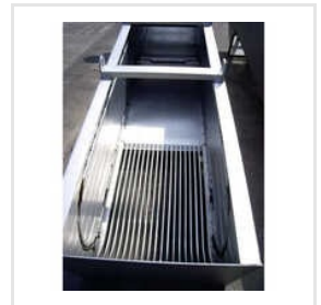
Multirake Bar Screen