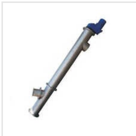
Mini Filtering Screw Screen