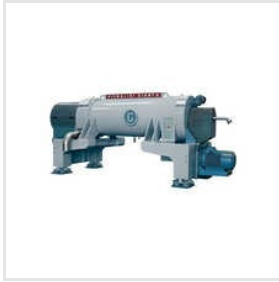
Industrial Decanter Separator Machine