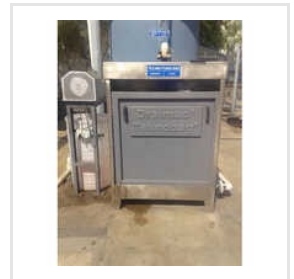
Sludge Dewatering Machine