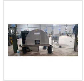
Arched Rotary Screen