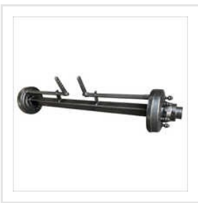
Brake Drum ADV Axle