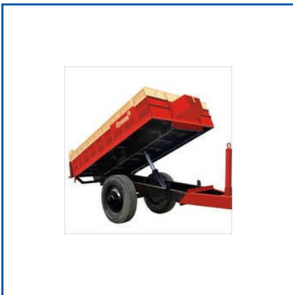
HYDRAULIC JACK FOR TRAILER