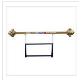
50mm Waterproof ADV Axle