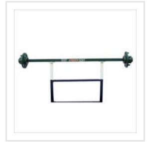
32mm ADV And Thresher Axle