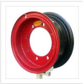
7.50-16 Tractor Trailer Flange Ring Lock Type