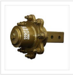
Tractor Half Axle