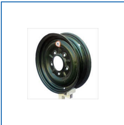
6.00-16 MM ADV THRESHER TYPE WHEEL RIM