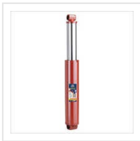
33 Inch Hydraulic Jack For Trailer