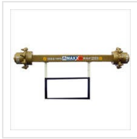
100mm Double Seal Trailer Axle