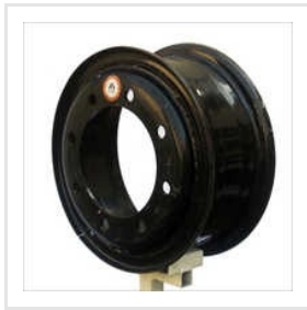
8.25-16 Mm Tractor Trailer Flange Ring