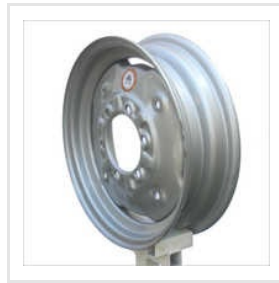
6.00-16 Mm Tractor Wheel Rim