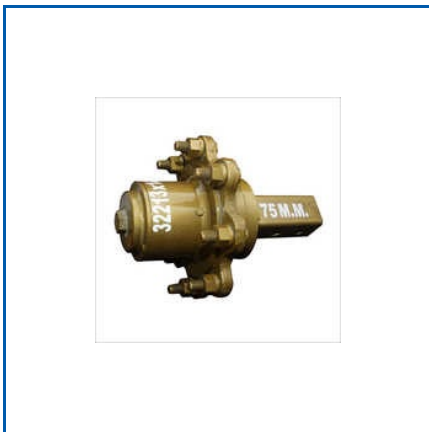
75MM TRACTOR HALF AXLE

10.00-20 mm Double Plated Split Type Tractor Trailer Wheel Rim, 100mm Double Seal Tractor Trailer Axle, 100mm Double Seal Trailer Axle, 100mm Waterproof Tractor Trailer Axle, 11.2-28 mm Tractor Wheel Rim, 12.4-28 Tractor Wheel Rim, 125mm Double Seal Trailer Axle, 13.6-28 Tractor Wheel Rim, 150mm Double Seal Trailer Axle, 2.5 inch Trailer Hook, 26 inch Hydraulic Jack for Trailer, 29 inch Hydraulic Jack for Trailer, 32mm ADV and Thresher Axle, 33 inch Hydraulic Jack for Trailer, 36mm ADV and Thresher Axle, etc.