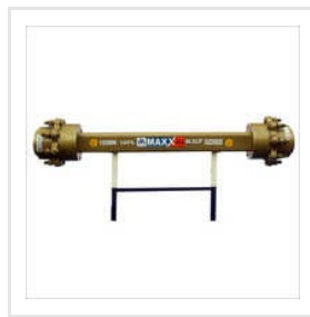
125mm Double Seal Trailer Axle