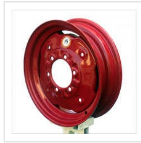
7.50-15 Mm Tractor Wheel Rim