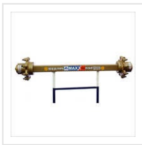
90mm Double Seal Trailer Axle