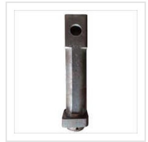
2.5 Inch Trailer Hook