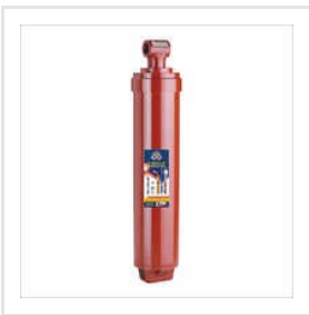
29 Inch Hydraulic Jack For Trailer