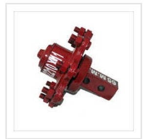
65mm Tractor Half Axle