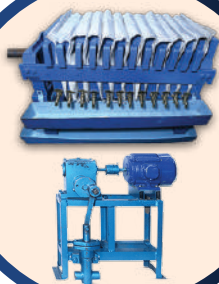
Plate Filter Machines