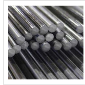
Silver Black Steel Round Bar