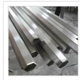
MS Hexagonal Bright Bar