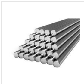
Alloy Steel Round Bars