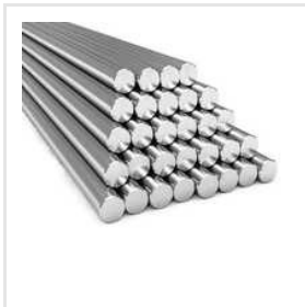
16MNCRS Bright Round Bar