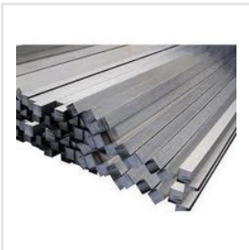
Mild Steel Square Bar