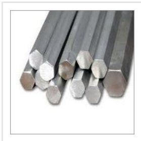
En8 Hex Bright Bar