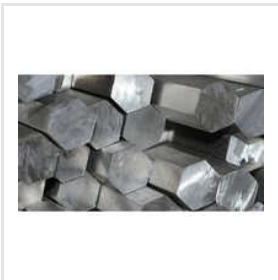
4140 Hex Bright Hex Bar