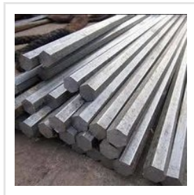
Mild Steel Hex Bright Bar