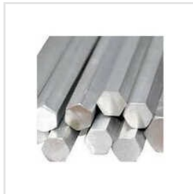
Ms Bright Hex Bar