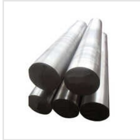
D2 Kni Round Bar