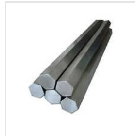
1018 Hex Bar