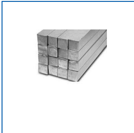
MS SQUARE BRIGHT BAR