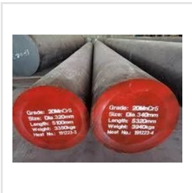
16 Mncr5 Round Bar Application