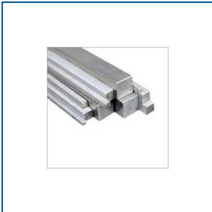
MS SQUARE BAR

1018 Hex Bar, 1018 Round Bar, 16 Mncr5 Round Bar Application, 16MNCRS Black Round Bar, 16MNCRS Bright Round Bar, 20MNCRS Black Round Bar, 20MNCRS Bright Round Bar, 4140 Black Round Bar, 4140 Bright Round Bar, 4140 Hex Bright Hex Bar, 52100 Black Round Bar, 8620 BRIGHT, 8620 Black Round Bar, 8620 Bright Round Bar, A105 Black Round Bar, etc.