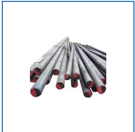
20MNCRS BLACK ROUND BAR