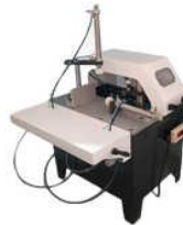
Atlas End Milling Machine