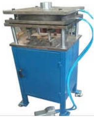
Aluminium Punching Machine