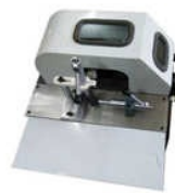
Portable End Milling Machine