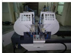
Automatic Aluminum And UPVC Door Cutting