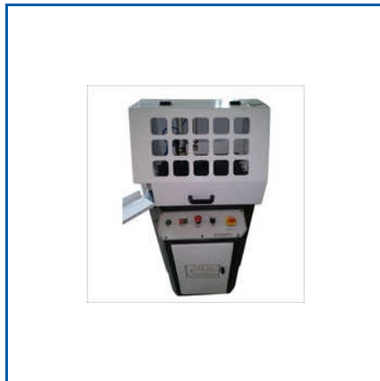
SINGLE HEAD MANUAL UPVC CUTTING MACHINE