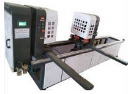
Heavy Duty UPVC Door Making Machine