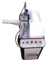
Aluminium Doors Making Machine