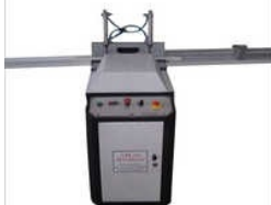
Automatic Glazing Blade Saw