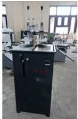
UPVC Window Portable Welding Machine