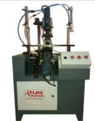
Three Axis Water Slot Machine