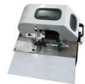
Aluminium Window Making Machine