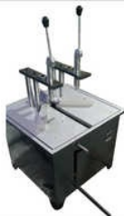
UPVC Portable Welding Machine