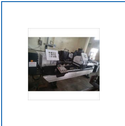
MANUAL DOUBLE HEAD ALUMINIUM CUTTING MACHINE

Aluminium Box Cutter, Aluminium Copy Router, Aluminium Doors Making Machine, Aluminium Punching Machine, Aluminium Window Fabrication Machine, Aluminium Window Making Machine, Aluminium-UPVC Portable End Milling Machine, Atlas End Milling Machine, Automatic Aluminium And UPVC Door Cutting Machine, Automatic Glazing Blade Saw, etc.