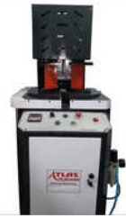
Single Head Welding Machine