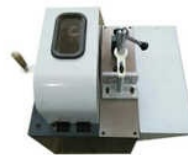
Aluminium-UPVC Portable End Milling