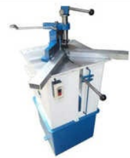
Aluminium Box Cutter