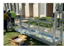
PIN TYPE SUSPENDED CRADLE SYSTEM