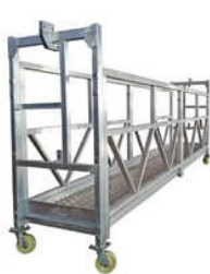
800 Kg Construction Suspended Platform