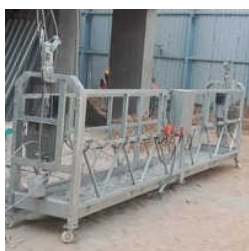
Working Cradle System