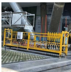
Suspended Platform Cradle System