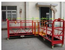
10 Feet Stainless Steel Cradle Suspended