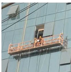
Construction Suspended Platform