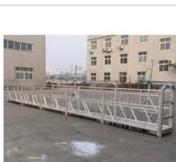
Mild Steel Suspended Working Platform