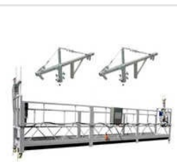
7.5 Meter Suspended Platform