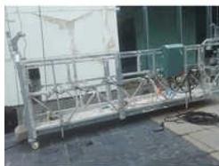
STEEL ROPE SUSPENDED PLATFORM