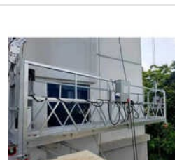
Galvanized Rope Suspended Platform