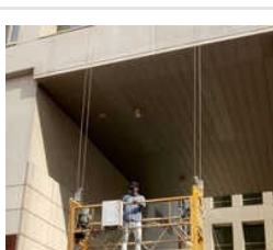
Suspended Rope Platform