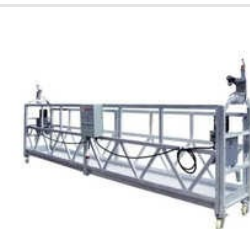
Mild Steel Wire Rope Suspended Platform