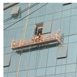
Suspended Working Platform