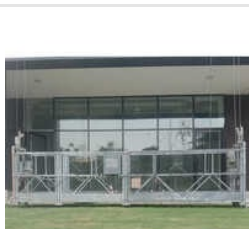
Suspended Gondola System