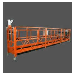
4 Feet Mild Steel Suspended Working