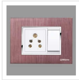
Brush Copper Rich Modular Plates