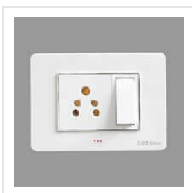
Nexon White Silver LED Modular Plates