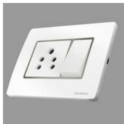
YOKO WHITE SILVER PLATINUM MODULAR PLATES

16A 1 Way Switch, 16A 2 Way Switch, 16A Combined Plate With Box, 16A Conversion Combined Plate With Box, 16A Multi Socket, 16A SS Combined With Box, 2-1-1 PVC Board, 2-2 PVC Board, 25A Motor Starter, 3-4 Pole Glass MCB Box, 32A C Series DP MCB, 32A DP Switch, 4 Module Foot Lamp, 4 Step Regulator Switch, 4 Way Closed Type Gang Box, etc.