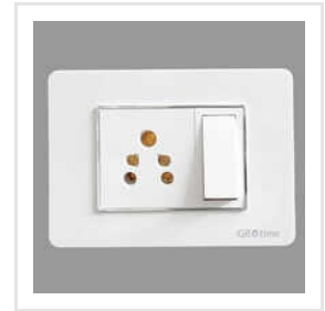
Smart Silver Modular Plates