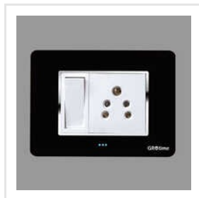
Nexon Metallic Black Silver LED Modular