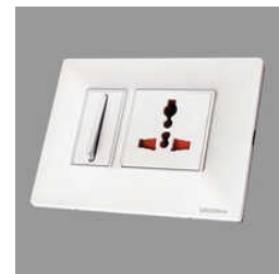
YANA WHITE SILVER PLATINUM MODULAR PLATES