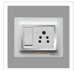
Prima Silver Line LED Modular Plates