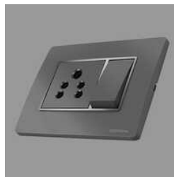
YOKO METALIC GREY PLATINUM MODULAR PLATES