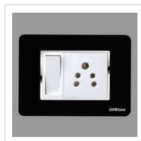
Smart Metallic Black Modular Plates