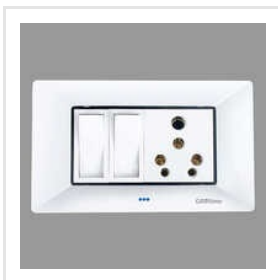
Kia LED Black Modular Plates