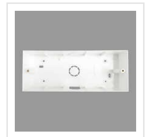
Modular Surface Boxes