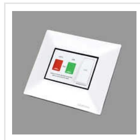
Conventional Modular Plates