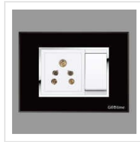
Rich Modular Plates