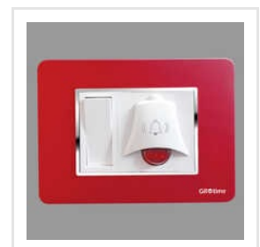
Smart Metallic Rose Modular Plates