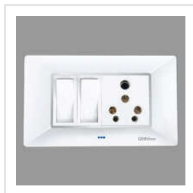
Kia LED Silver Modular Plates