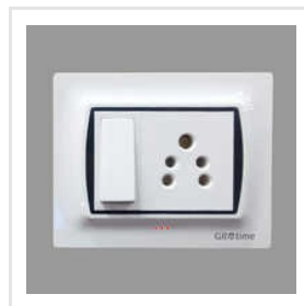
Prima Black Line LED Modular Plates