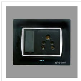
Prima Metallic Black Silver Line LED Modular