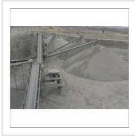
Sand Making Plant