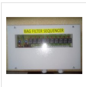
Sequential Timer Card