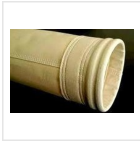
Pps Rayton Procen Filter Bags