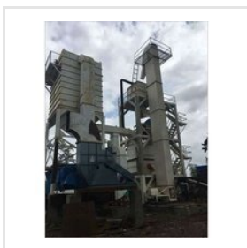
Air Washing Fine Removal Plant