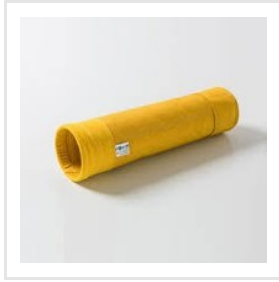
P 84 Filter Bags