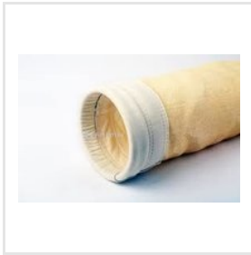
Homopolymer Acrylic Filter Bags