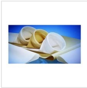
Polyester Filter Bags