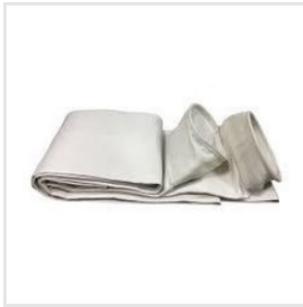
Woven Glass PTFE Membrane Filter Bag