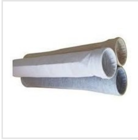
Woven Polyester Rabh