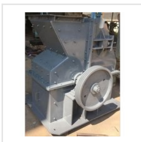
Horizontal Shaft Impact Crusher