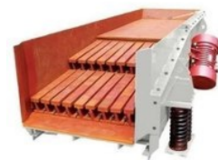
VIBRATING GRIZZLY FEEDERS