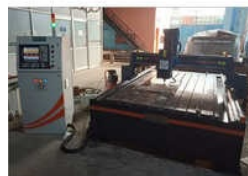
CNC Wood Carving Machine