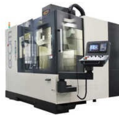
Industrial CNC Wood Router Machine