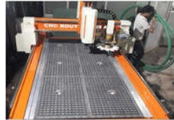
ATC Wood Router