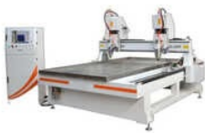
CNC WOOD ROUTER MACHINE WITH ATC

1325 CNC Router Machine, 1325 Carving Machine, 3D Wood Carving Machine, 6 KW TCIPL 1325 R CNC Engraving Machine, All In One CNC Engraving Machine, Aluminium Pattern Making CNC Router Machine, Automatic CNC Router Machine, Automatic Signage CNC Router Machine, Automatic Tool Changing CNC Router Machine, etc.