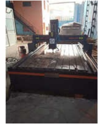
Fully Automatic CNC Wood Carving Machine