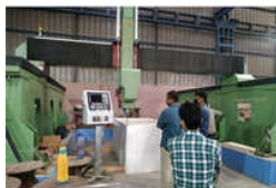
Thermocol Pattern CNC Router