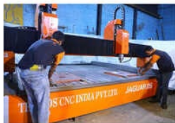
Double Spindle Stone Router