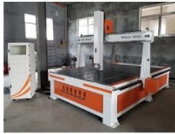
CNC Pattern Making Router Machine