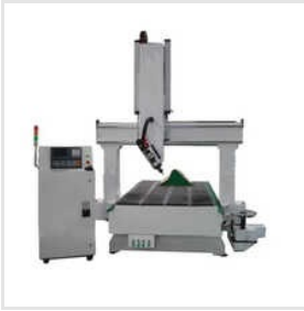
4 Axis Wood Router Machine