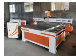
TCIPL 1325 CNC WOOD CARVING ROUTER MACHINE