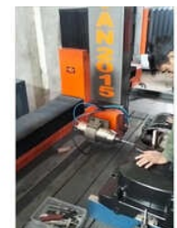
Four Axis CNC Router