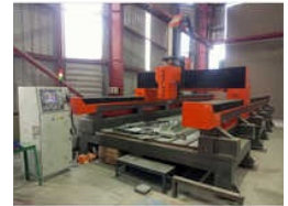
Aluminium Pattern Router