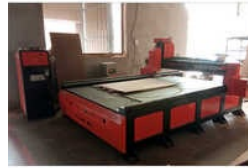
Wood Router Machine