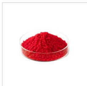
Acid Red 114 Dyes