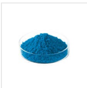
Acid Blue 7 Dyes