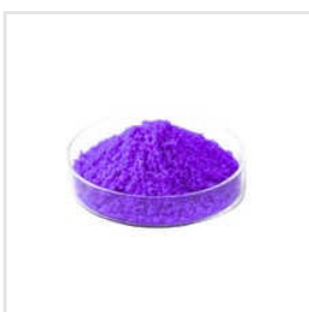
Acid Violet 49 Dyes