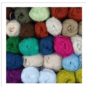
Acid Colours Dyes For Wool