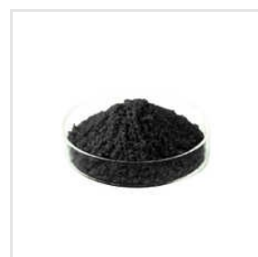
Acid Black 2 Dyes