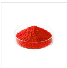
Acid Red 52 Dyes