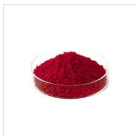
Acid Red 119 Dyes