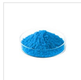
Acid Blue 9 Dyes