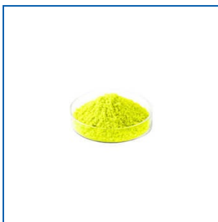
ACID YELLOW 3 DYES