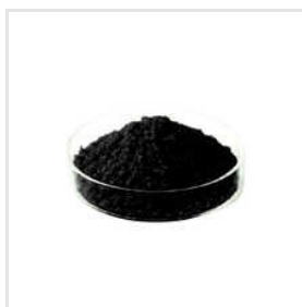
Acid Black 1 Dyes