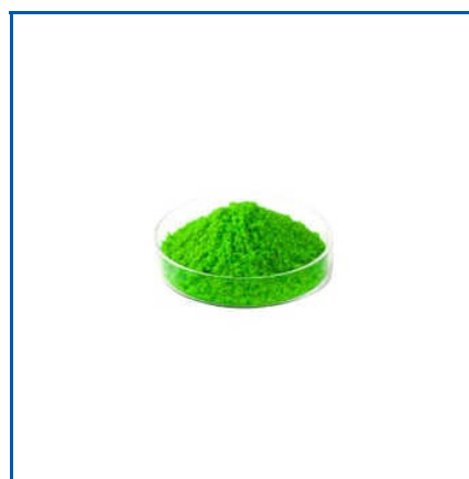
ACID GREEN 16 DYES