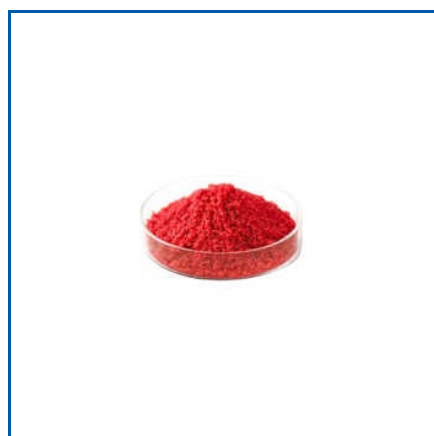
ACID RED 88 DYES

2B Optical Whitening Agent, Acid Black 1 Dyes, Acid Black 194 Dyes, Acid Black 2 Dyes, Acid Black 210 Dyes, Acid Black 234 Dyes, Acid Blue 1 Dyes, Acid Blue 113 Dyes, Acid Blue 15 Dyes, Acid Blue 158 Dyes, Acid Blue 193 Dyes, Acid Blue 7 Dyes, Acid Blue 9 Dyes, Acid Brown 45 Dyes, Acid Colours Dyes for Nylon Silk, etc.