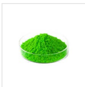
Acid Green 16 Dyes