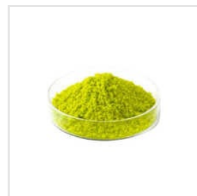
Acid Yellow 110 Dyes