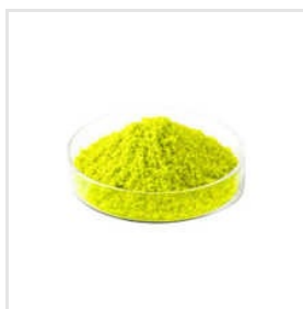
Acid Yellow 17 Dyes