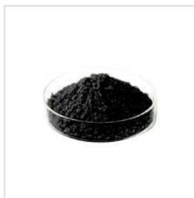
Acid Black 234 Dyes