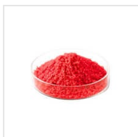
Acid Red 131 Dyes