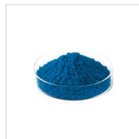
Acid Blue 113 Dyes