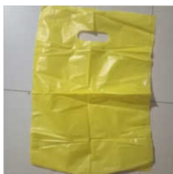
Biodegradable Yellow Carry Bags