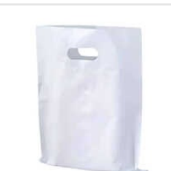
Eco-Friendly Bags For Retail Packaging