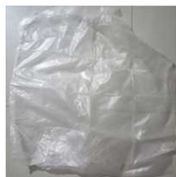
Plain Biodegradable Carry Bags