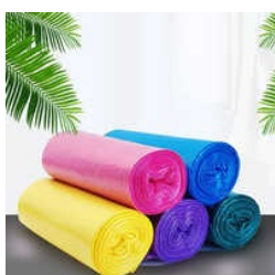
Bio Plastic Bag