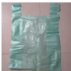
Biodegradable Green Carry Bag