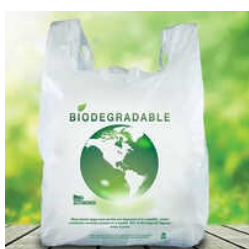
Eco Friendly Biodegradable Bags