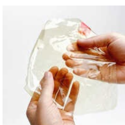
Bioplastic Bag For Packaging