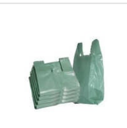
Biodegradable Bags For Food Packaging