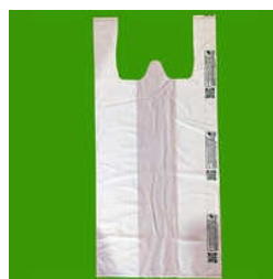
BIODEGRABLE CARRY BAG