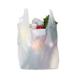
White Biodegradable Bags