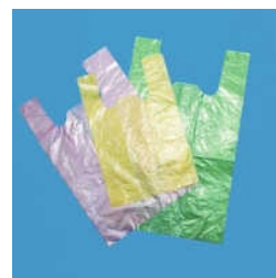
Eco-Friendly Packaging Bag