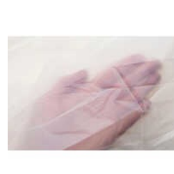
Starch Based Bioplastic Bag