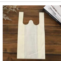
Biodegradable Raw Bags