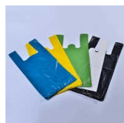
Biodegradable Packaging Bags