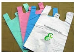
BIODEGRADABLE COLOR BAGS

01_Polybutylene Adipate Co-Butylene Terephthalat, 02_D Cut Carry Bag, 02_Polybutylene Adipate Co-Butylene Terephthalat, Bio Filler, Bio Plastic Bag, Bio-Based Bags, Bio-Based Polyethylene Bags, Biodegradable Carry Bag, Biodegradable Raw Material, Biodegradables Polymers, etc.