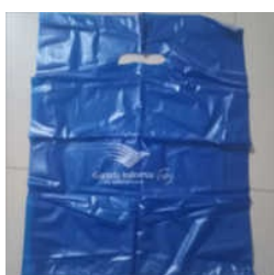
Biodegradable Blue Carry Bag