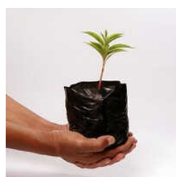
Biodegradable Nursery Poly Bag