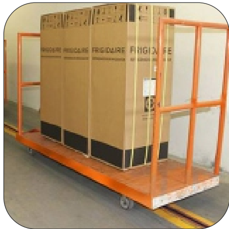
Tow Line Conveyor For Refrigerator