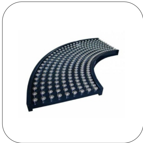
Curve Type Ball Conveyor