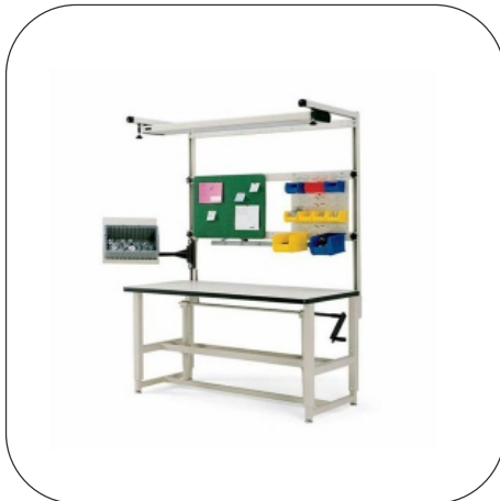
Adjustable Work Station