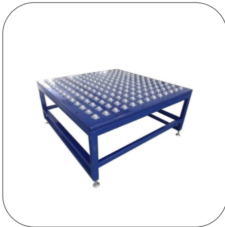
Ball Transfer Table