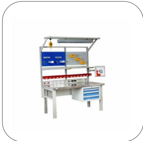
Spring Balancer Work Table