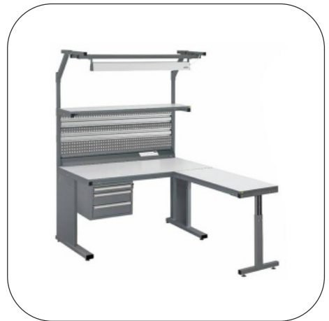
L Type Assembly Table