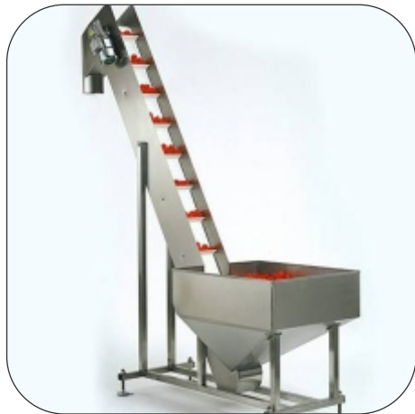
Elevator Belt Conveyor