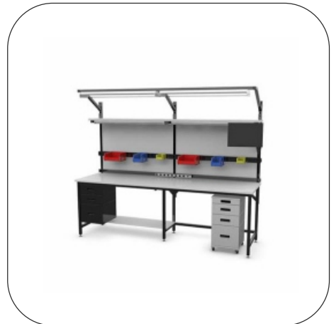
ESD Work Bench