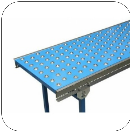
Adjustable Ball Conveyor