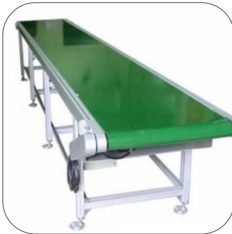
Aluminium Section Conveyor