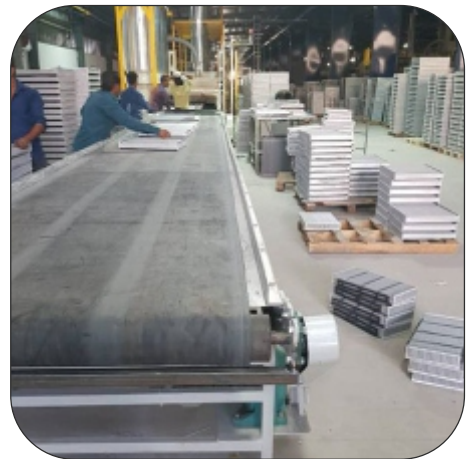
Rubber Belt Conveyor