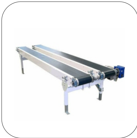
Double Decker Belt Conveyor