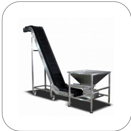
SS Sidewall Cleated Belt Conveyor