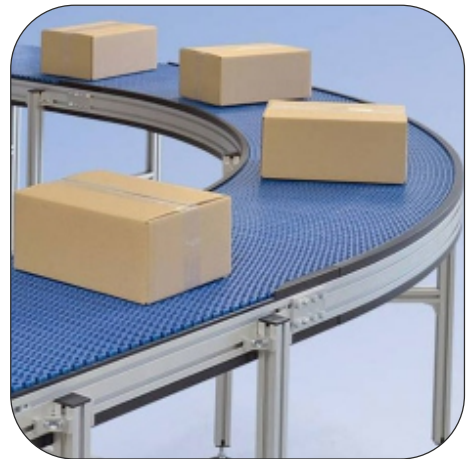
Modular Belt Conveyor