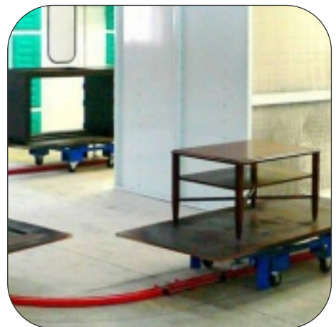
Tow Line Conveyor For Wood Conveyor