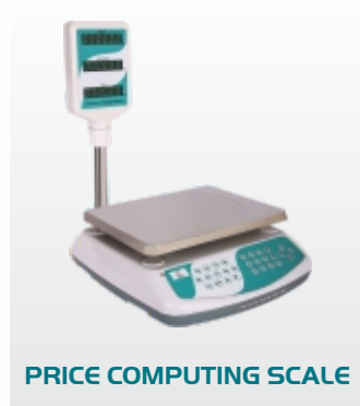
TABLE TOP SCALES