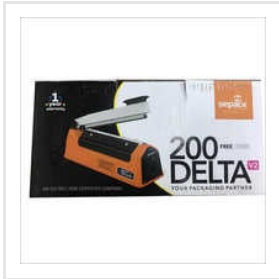
Hand Impulse Sealer 8 Inch - Sepack