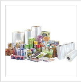
Polyolefin Shrink Film