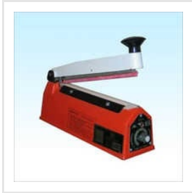
Sevana Hand Sealer Machine