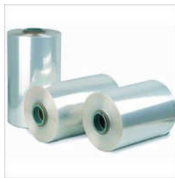
PVC SHRINK FILM