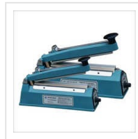
Impulse Hand Sealer