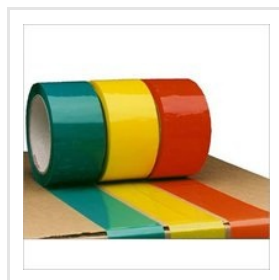
Colourful Packaging Tape