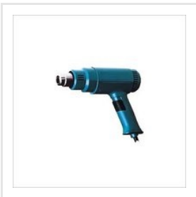
Two Speeds Heat Gun