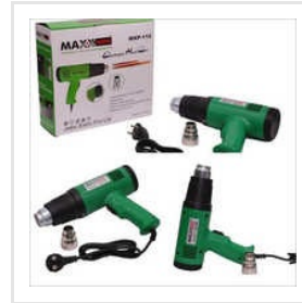
Maxx Pamma Mxp112