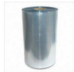
PLAIN PVC PACKAGING SHRINK FILM