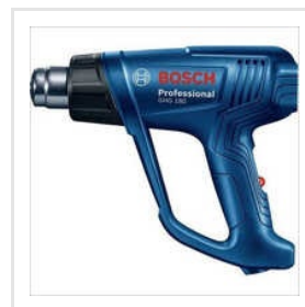
Bosh Professional GHG 180 Heat Gun