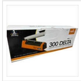
Hand Sealing Machine 12 Inch