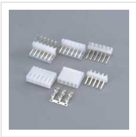
2510 Pin Connector