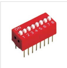
Dip Switch Series Connector