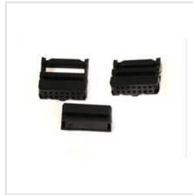
CPU Wire Harness Connector