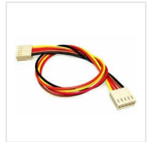
2.5 MM Relimate Connector