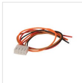
Cpu Power Connector