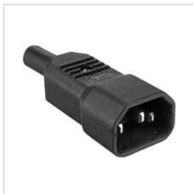
ELCOM Electrical Connector