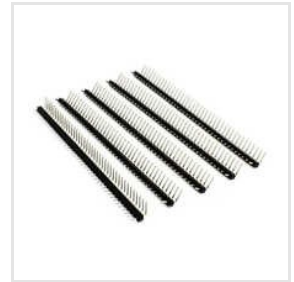
5 MM Berg Strip Connector