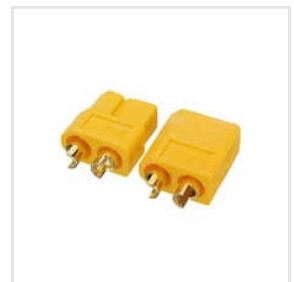
XT60 Electrical Connector