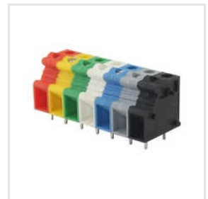
PCB Mount Terminal Block