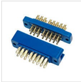
Rack And Panel Miniature Connector