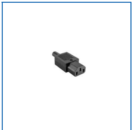
ELCOM EMO 40 CONNECTORS