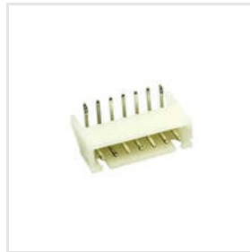
Jst Pcb Connector