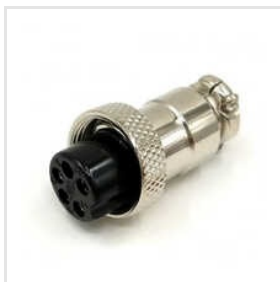
SS Metal Connector