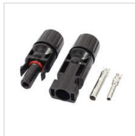
MC 4 Connector