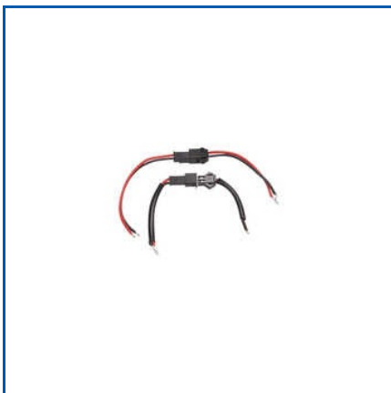
LED LIGHT CONNECTOR

10A Barrier Type Terminal Block, 12A Barrier Terminal Block, 12V Chee Siron, 14 Pin FRC Cable, 2 Pin Power Socket, 2 Pins Ceramic Varistor, 2 Pins Double Decker PCB Terminal Block, 2 Pins PCB Terminal Block, 2.5 MM Relimate Connector, 20A Miniature Toggle Switch, 220 V AC LED Indicator, 250V AC Elcom Emi Rfi Filter, 2510 Pin Connector, 2mm Banana Connector, 3 Core Flat Cable, etc.