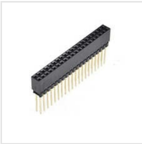
Flow Header Connector