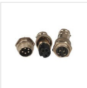
Load Cell Connectors