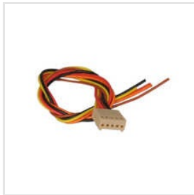
Relimate CPU Connectors