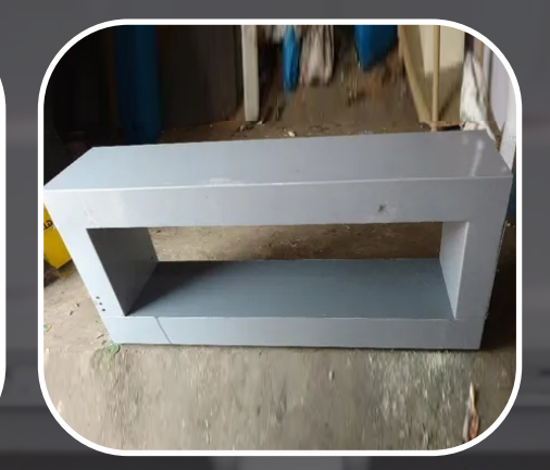
Industrial Metal Detectors