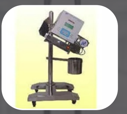
Digitech 75 Metal Detector