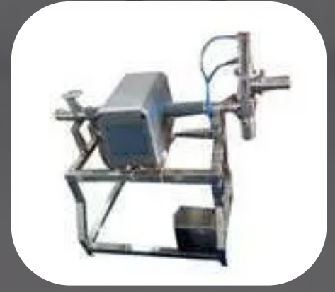
Liquid Line Metal Detectors