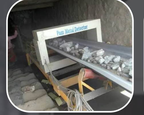
Stone Crusher Metal Detector