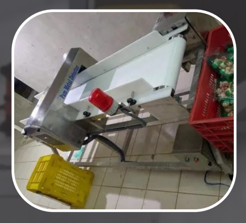
Pulse induction Metal Detector