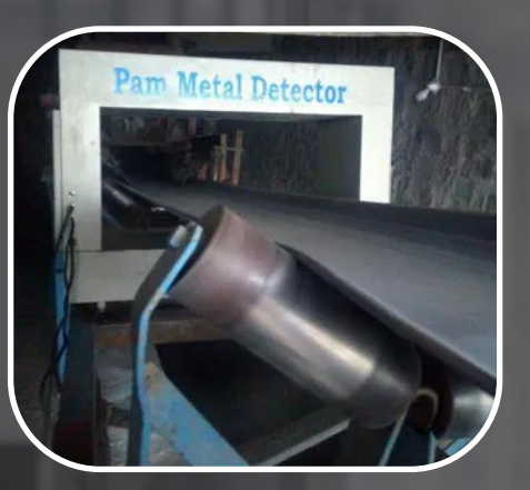
Ferrous Metal Detector