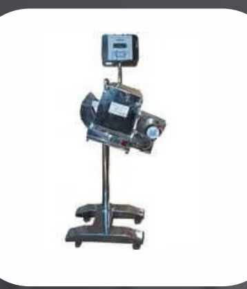
Digitech Pharma Metal Detector