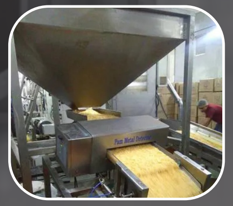
Food Stand Metal Detector