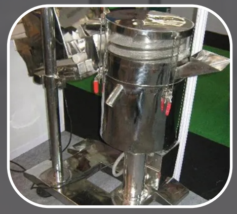
De-Duster Pharma Metal Detector