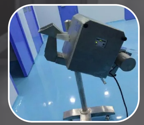
Pharma Metal Detector