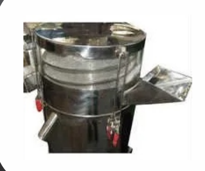
Tablet Dedusting Machine