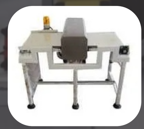
Micro Scan Metal Detector