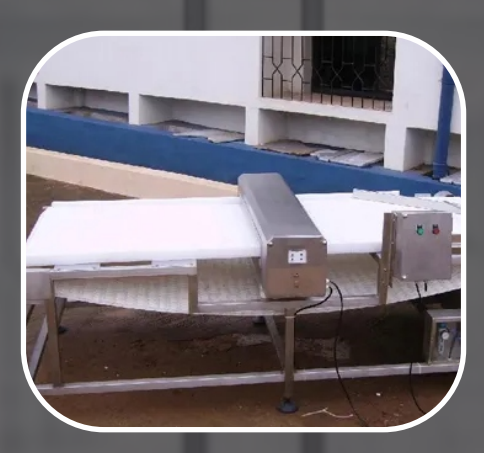
Mini Scan Metal Detector