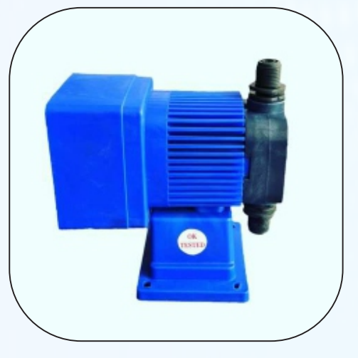
Mini Flow Pumps