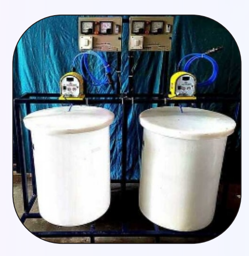
Dosing System 1W 1S