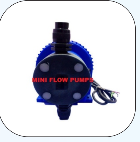
Solenoid Dosing Pumps (Commertial)