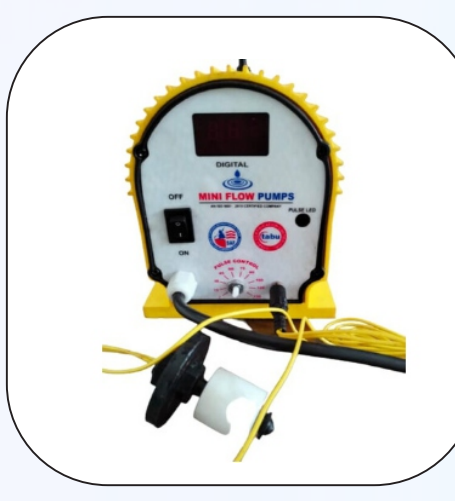
Sensor Dosing Pump