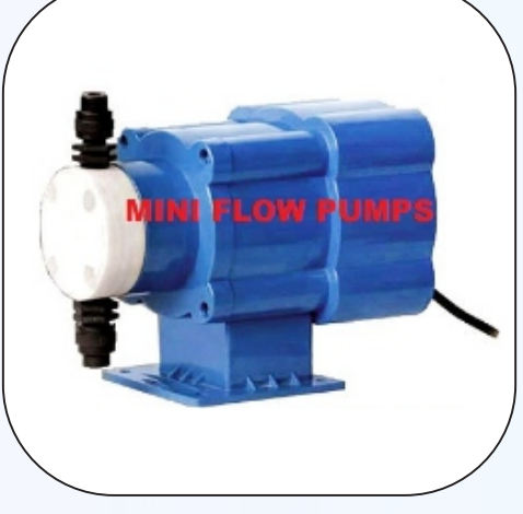
Solenoid Actuated Diaphragm Pump