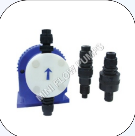
Chemical Dosing Pump