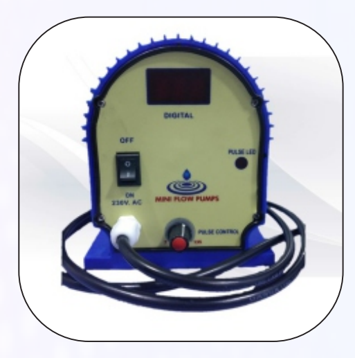
Industrial Mini Flow Pumps