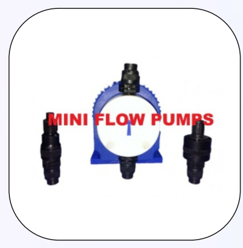
Commercial Mini Flow Pumps