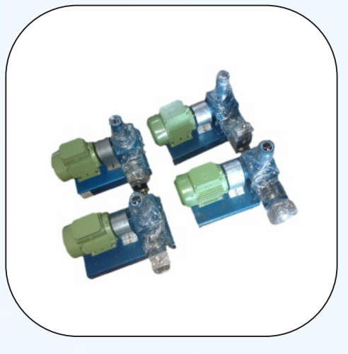
Plunger Metering Pump