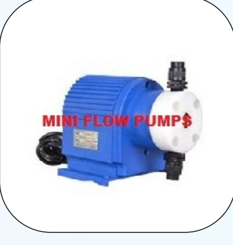
Hypo Chlorine Dosing Pump