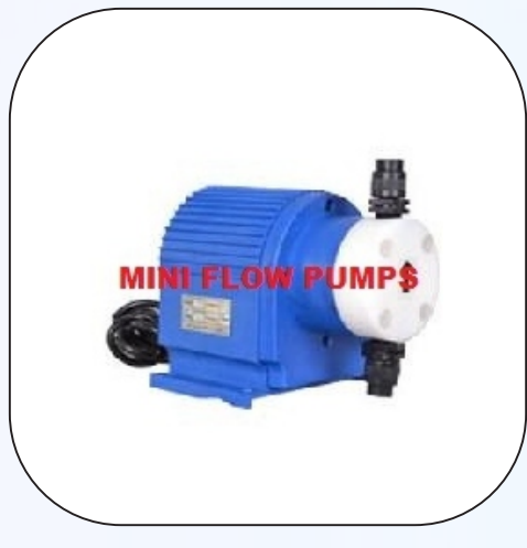
Electronic Dosing Pump