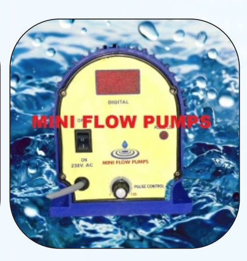
Mini Dosing Pumps