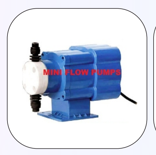
RO Dosing Pumps