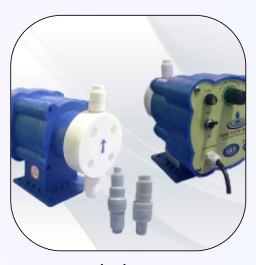
MED-6/10/20 LPH HCL Dosing Pump