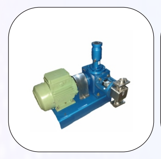
Poly Dosing Pump