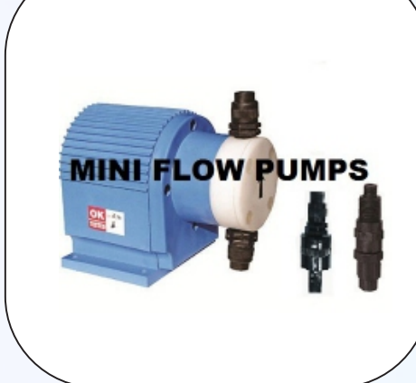
Solenoid Operated Dosing Pump(commercial)