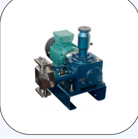
Industrial Plunger Type Dosing Pump