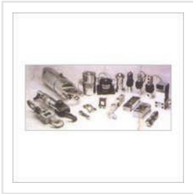
Weighing Load Cell