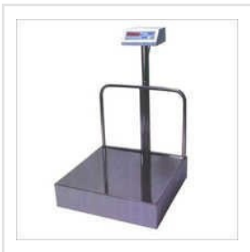
Platform Weighing Scale