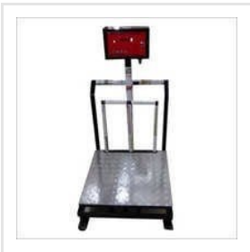
Platform Weighing Machines