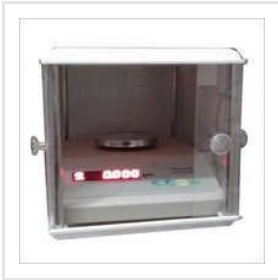
Gold Weighing Machines