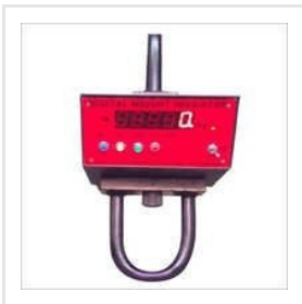
Crane Weighing System