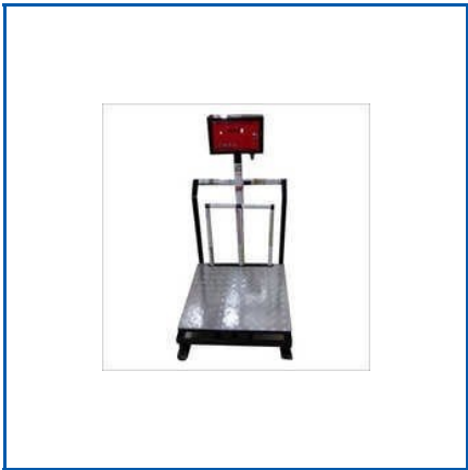
PLATFORM WEIGHING MACHINES