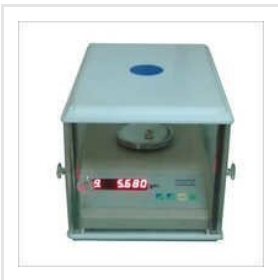
Jewelery Weighing Scale