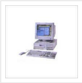
Computer Based Weighing Systems