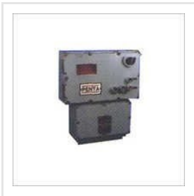
Flame Proof Scale