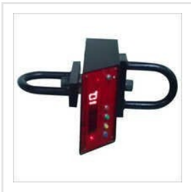
Digital Weighing Machines