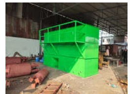
Sewage Treatment Plant Installations