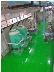
Compact Sewage Treatment Plant