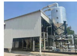
ZERO LIQUID DISCHARGE PLANT