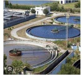
Prefabricated Sewage Treatment Plant