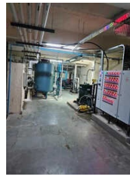
Industrial Etp Plant