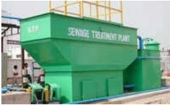
Biological Sewage Treatment Plant