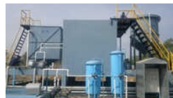
Effluent Treatment System