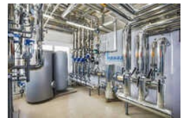
Zero Liquid Discharge Treatment Plant