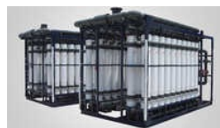
ZERO LIQUID DISCHARGE SYSTEM