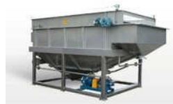
Dissolved Air Flotation Units