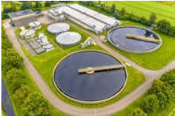
Sewage Wastewater Treatment Plant