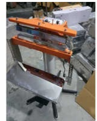
Bag Sealing Machine