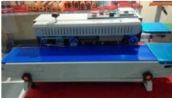
Band Sealing Machine