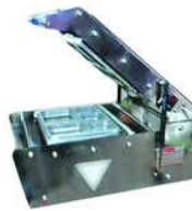
Food Tray Sealing Machine