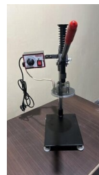
Foil Sealing Machine