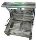
PORTION MEAL TRAY SEALING MACHINE

Bag Sealing Machine, Band Sealing Machine, Continuous Band Heat Sealer, Cup Sealing Machine, Foil Sealing Machine, Food Thali Sealing Machine, Food Tray Sealing Machine, Foot Operated Impulse Sealer, Fully Automatic Heat Shrink Tunnel Machine, Glass Sealing Machine, Hand Operated Direct Heat Sealer, Hand Operated Impulse Heat Sealer, Hand Operated Jar Sealing Machine, Heat Conveyor Shrink Tunnel Machine, Hot Sealing Machine, etc.