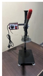
Hand Operated Jar Sealing Machine