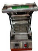
Hot Sealing Machine