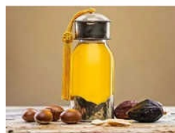
Mahua Seed Oil