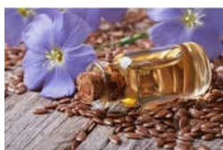
Cold Pressed Linseed Oil