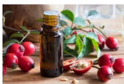
Rose Hip Oil