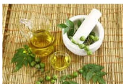
Cold Pressed Neem Oil