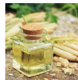
Lemongrass Natural Essential Oil