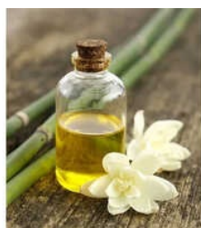
Tuberose Burning Oil