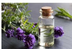
Natural Lavender Oil