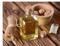
Nutmeg Oleoresins Oil