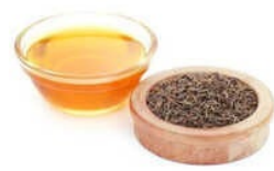
Cold Pressed Caraway Oil